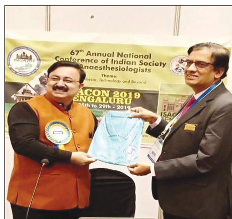
Releasing New ISA T-Shirt