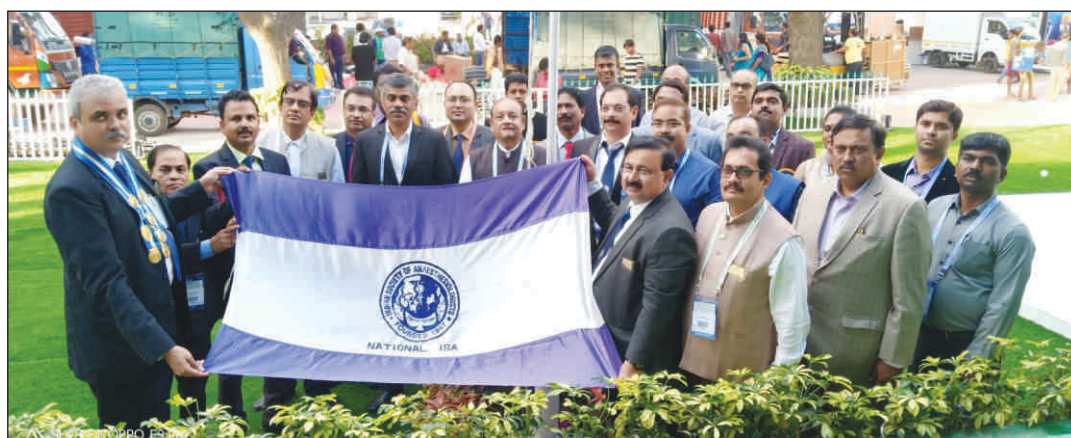
Lowering of ISA Flag