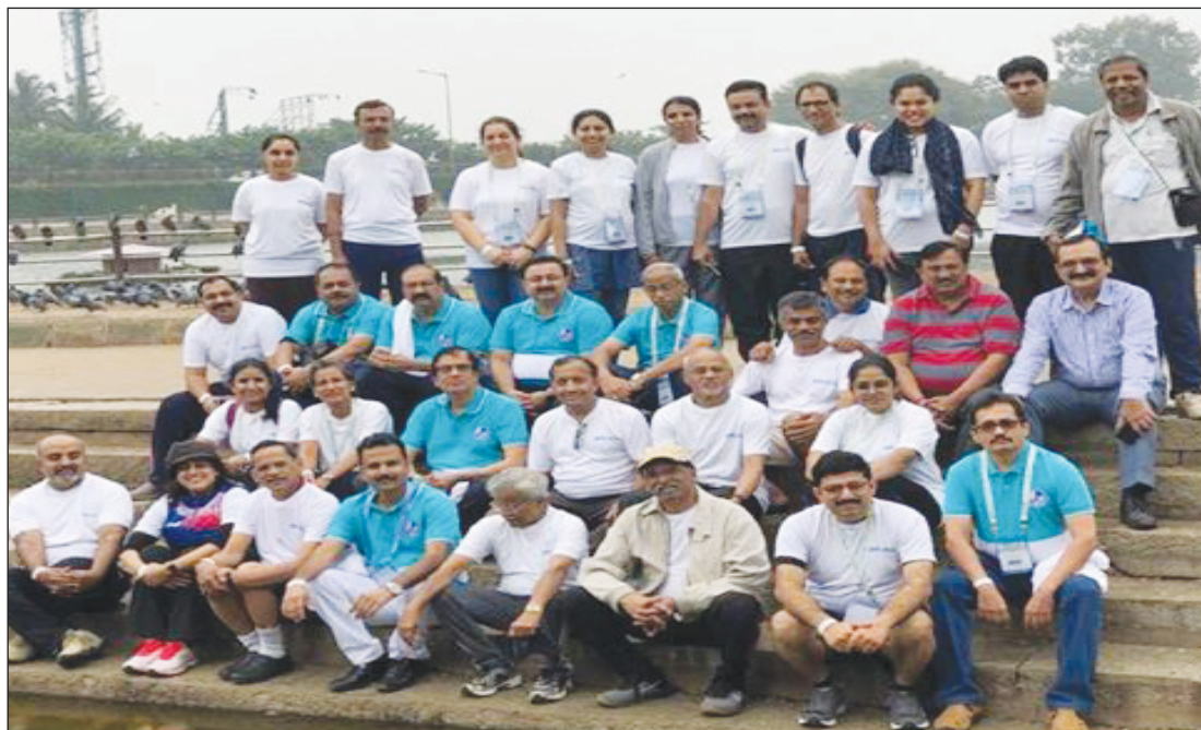
ISA FIT ANAESTHESIOLOGIST CAMPAIGN Formal Launching of ISA Fit Anaesthesiologist Campaign by holding a WALK A THON