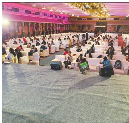
ISA NEON INLAND & INTERNATIONAL FELLOWSHIP EXAM