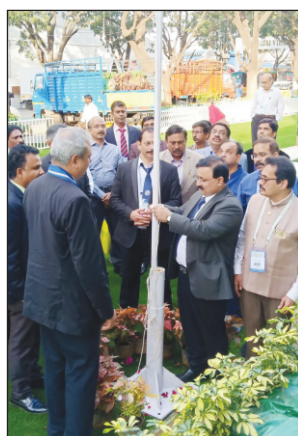
Lowering of ISA Flag