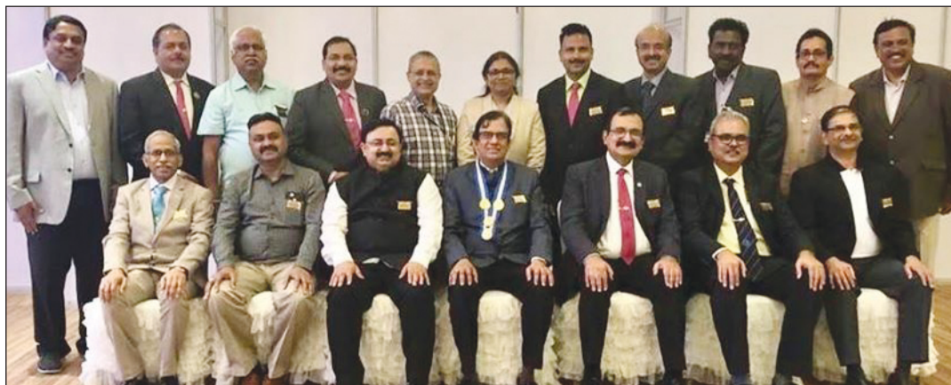
The Governing Council of ISA