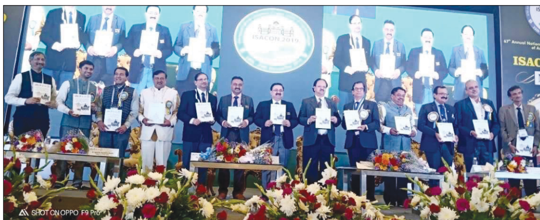
Release of latest issues of The ISAIAN- Official E Newsletter of ISA, Northern Journal of ISA, Central Journal of ISA and CME Book & Souvenir of ISACON 2019