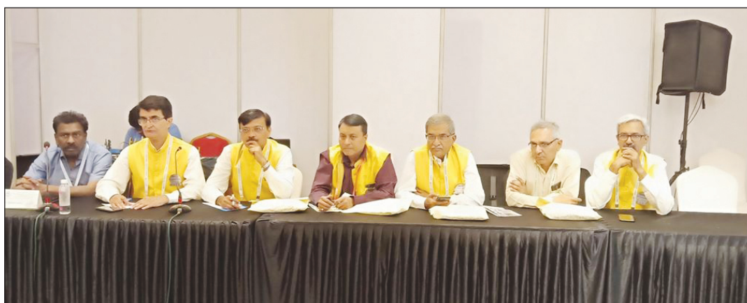
Meeting with Organising Committee of 68 th ISACON Ahmedabad