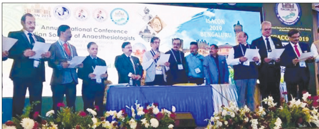
ISA Oath Ceremony