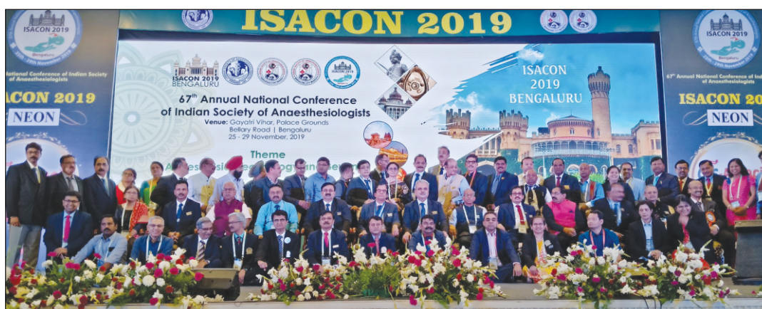
ISA National Governing Council with State and City Office Bearers after a successful ISA Session