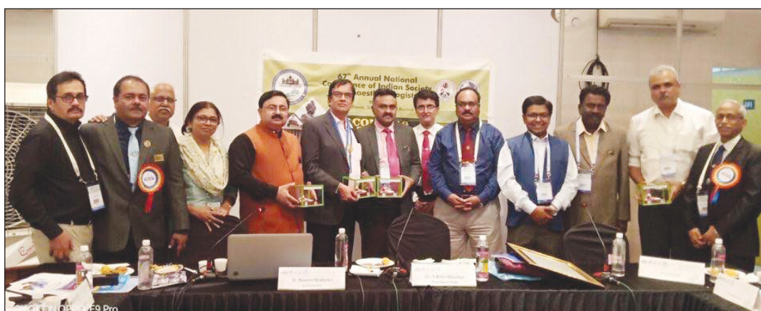
Meeting with Indian Resuscitation Council (ISA IRC)