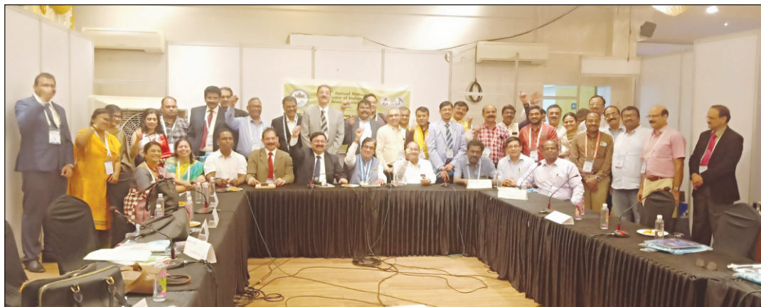
Meeting with The Back Bone of ISA - The State and City Branch Office Bearers