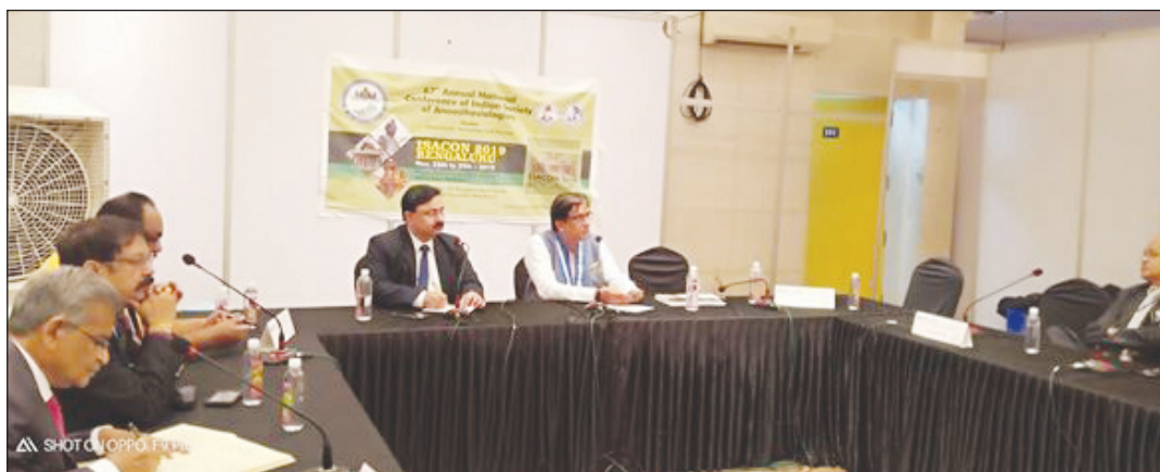
Meeting With Esteemed Past Presidents of Indian Society of Anaesthesiologists