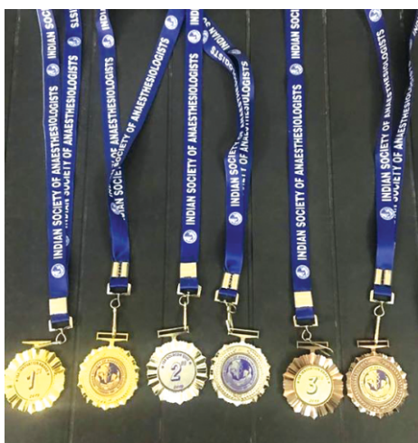
New Design of ISA National Medals