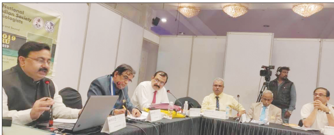
The ISA Governing Council Meeting