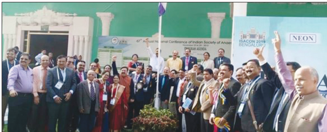
ISA National Flag Hoisting