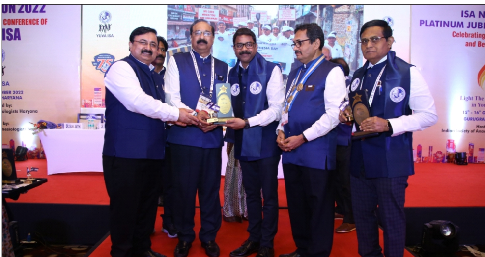
Felicitation of ISA State & City Branch Office Bearers ISA National Platinum Jubilee Celebrations, Gurugram, Haryana (15 October 2022)