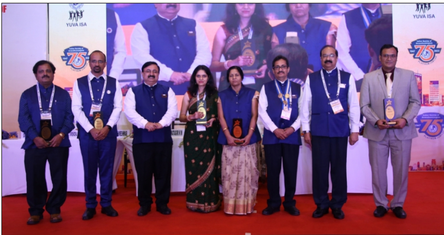
Release of ISA Virtual Museum ISA National Platinum Jubilee Celebrations, Gurugram, Haryana (15 October 2022)