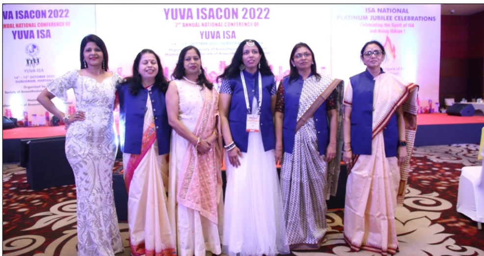
ISA National Platinum Jubilee Celebrations Gurugram, Haryana (15 October 2022)