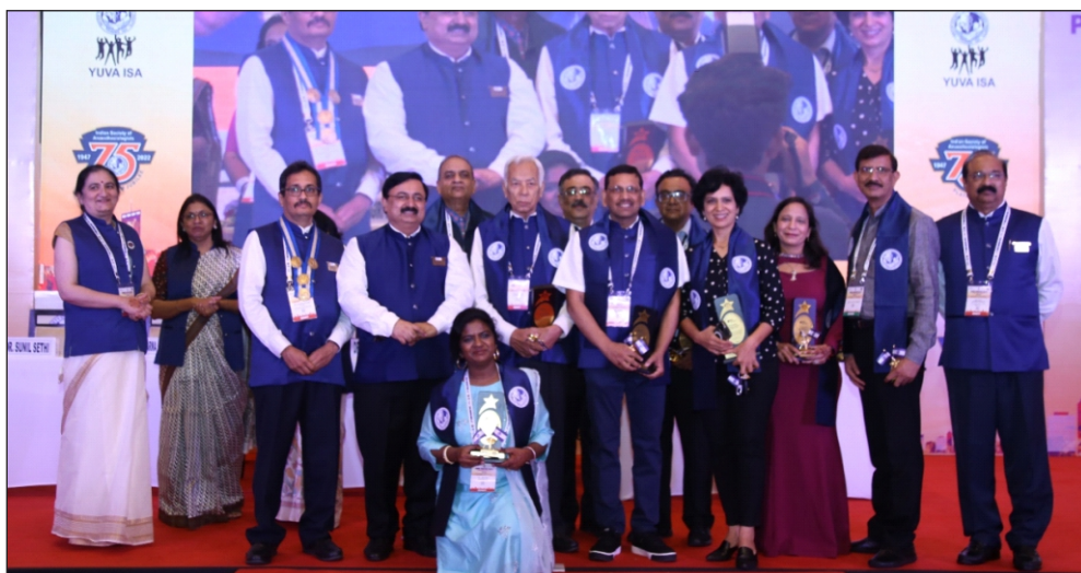
Felicitations of ISA State & City Branch Office Bearers ISA National Platinum Jubilee Celebrations, Gurugram, Haryana (15 October 2022)