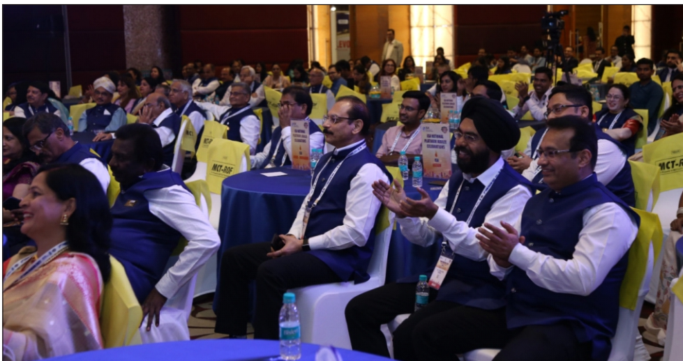
Inaugural Ceremony ISA National Platinum Jubilee Celebrations, Gurugram, Haryana (15 October 2022)