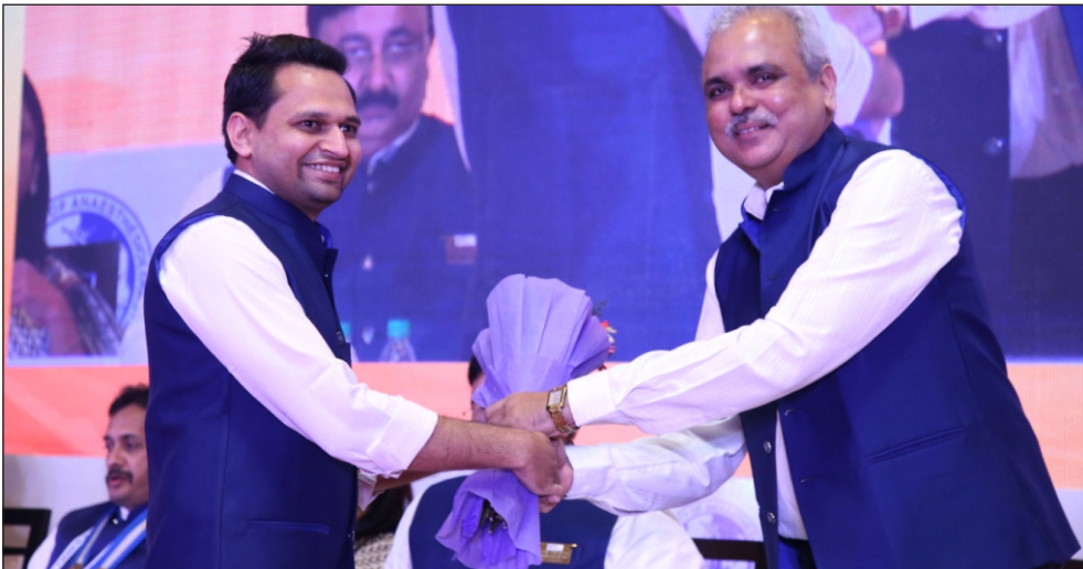
Inaugural Ceremony ISA National Platinum Jubilee Celebrations, Gurugram, Haryana (15 October 2022)