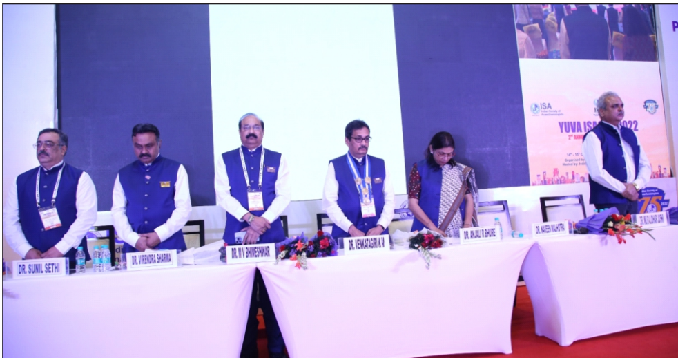
Inaugural Ceremony ISA National Platinum Jubilee Celebrations, Gurugram, Haryana (15 October 2022)