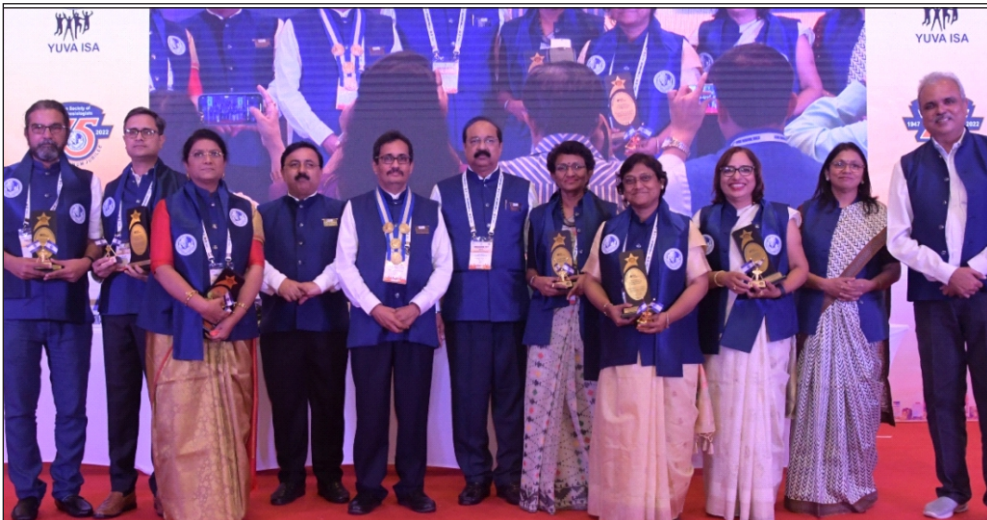
Felicitation of ISA State & City Branch Office Bearers ISA National Platinum Jubilee Celebrations, Gurugram, Haryana (15 October 2022)