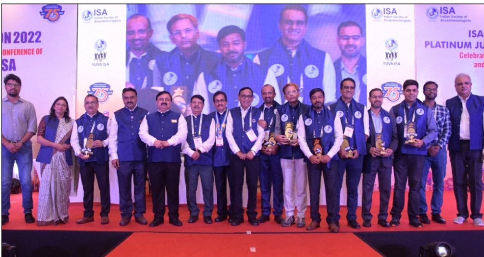
Felicitation of ISA State & City Branch Office Bearers ISA National Platinum Jubilee Celebrations, Gurugram, Haryana (15 October 2022)