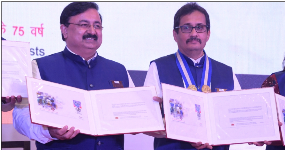
Release of Special Postal Cover ISA National Platinum Jubilee Celebrations, Gurugram, Haryana (15 October 2022)