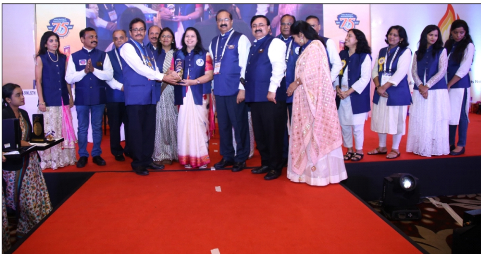
Felicitation of ISA State & City Branch Office Bearers ISA National Platinum Jubilee Celebrations, Gurugram, Haryana (15 October 2022)