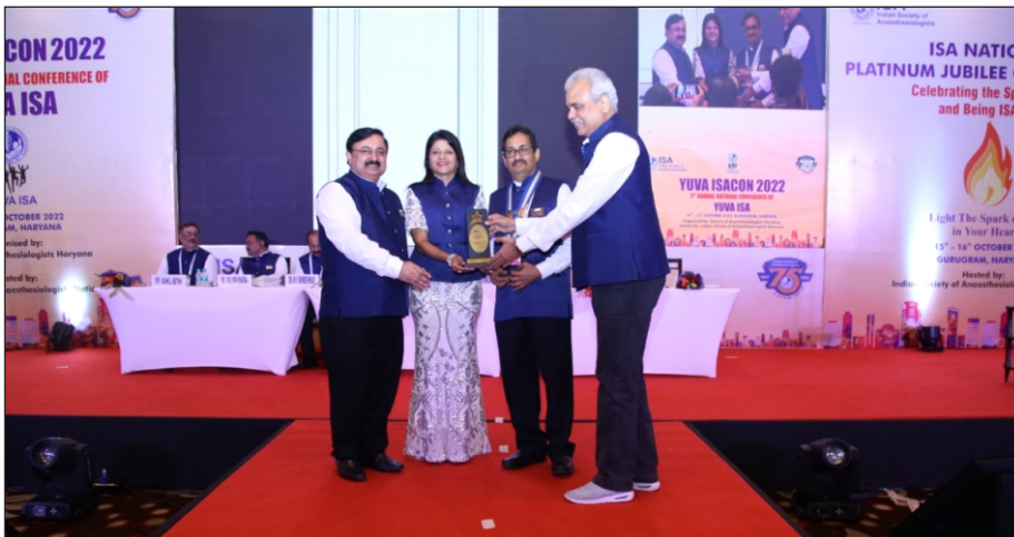
Release of ISA Calendar of Events ISA National Platinum Jubilee Celebrations, Gurugram, Haryana (15 October 2022)