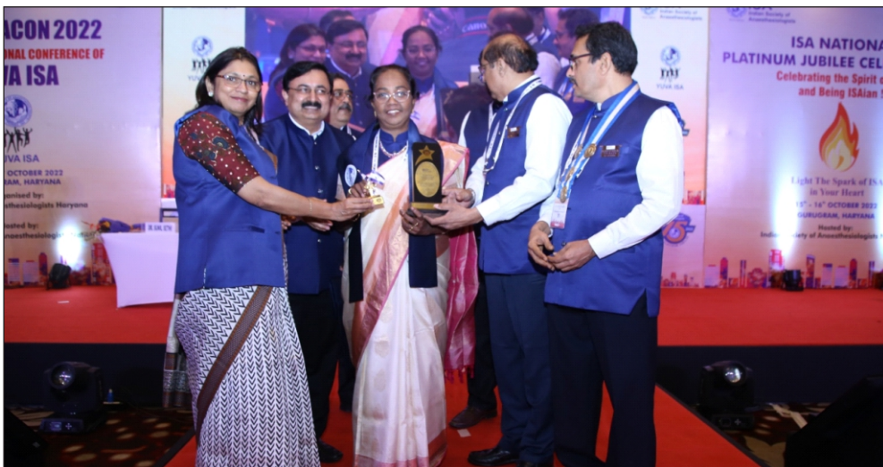
Felicitation of ISA State & City Branch Office Bearers ISA National Platinum Jubilee Celebrations, Gurugram, Haryana (15 October 2022)