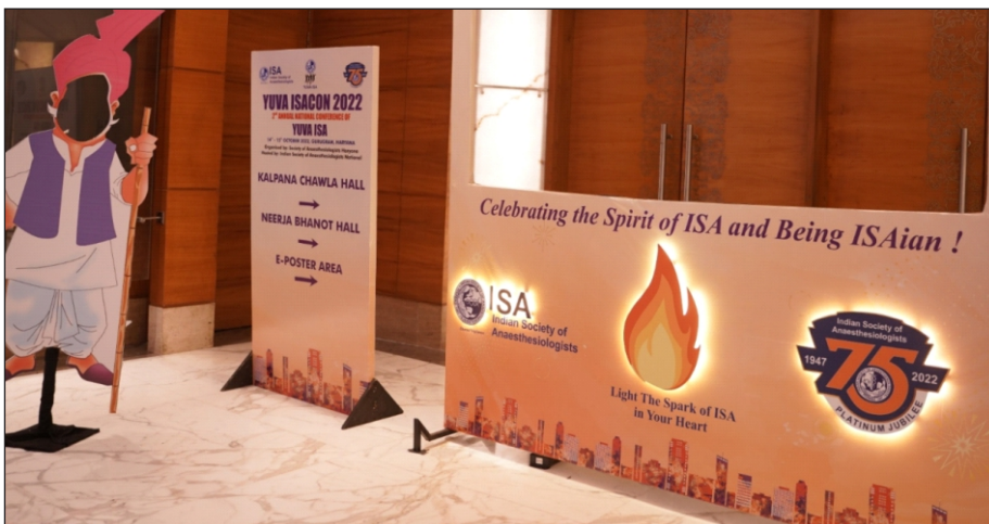
ISA National Platinum Jubilee Celebrations Gurugram, Haryana (15 October 2022)