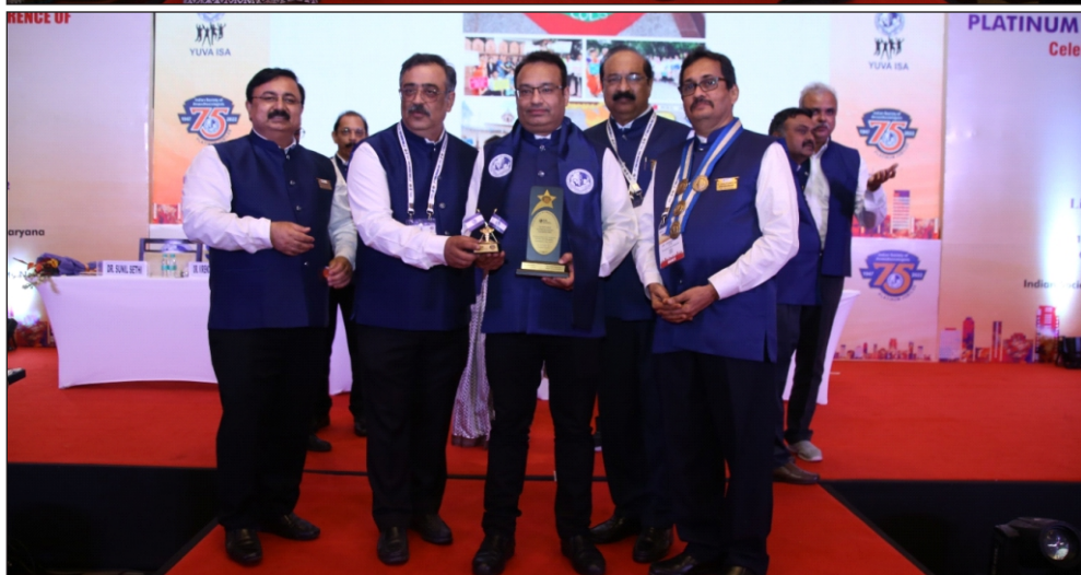
Felicitation of Past ISA National Governing Council Members ISA National Platinum Jubilee Celebrations, Gurugram, Haryana (15 October 2022)