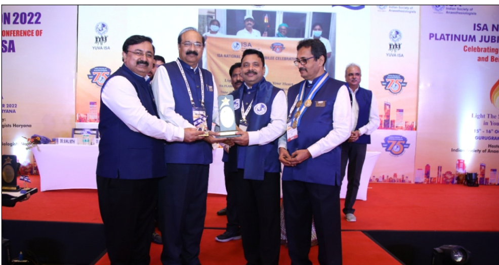
Felicitations of ISA State & City Branch Office Bearers ISA National Platinum Jubilee Celebrations, Gurugram, Haryana (15 October 2022)