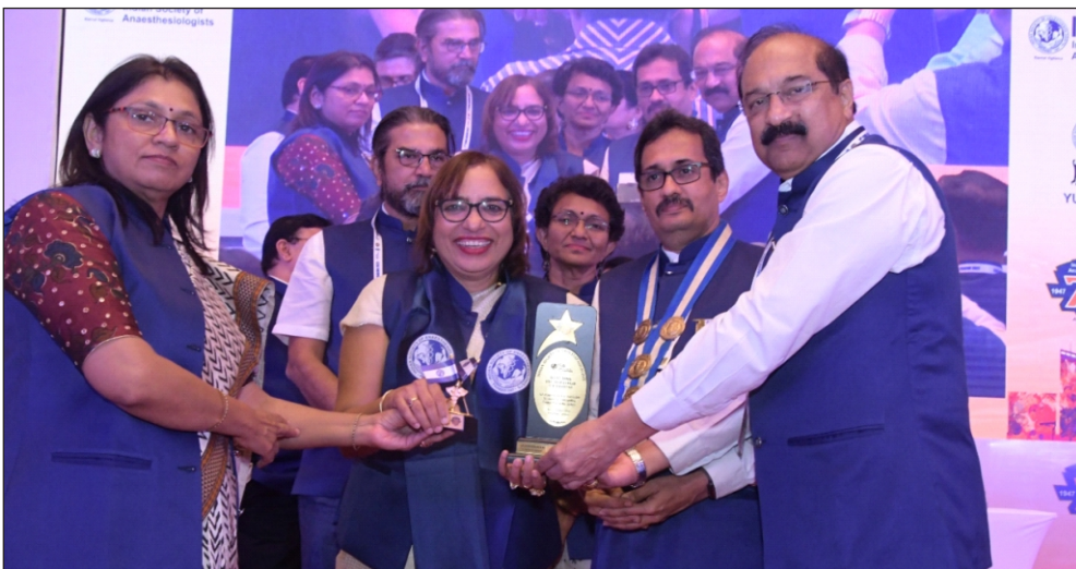
Felicitations of ISA State & City Branch Office Bearers ISA National Platinum Jubilee Celebrations, Gurugram, Haryana (15 October 2022)