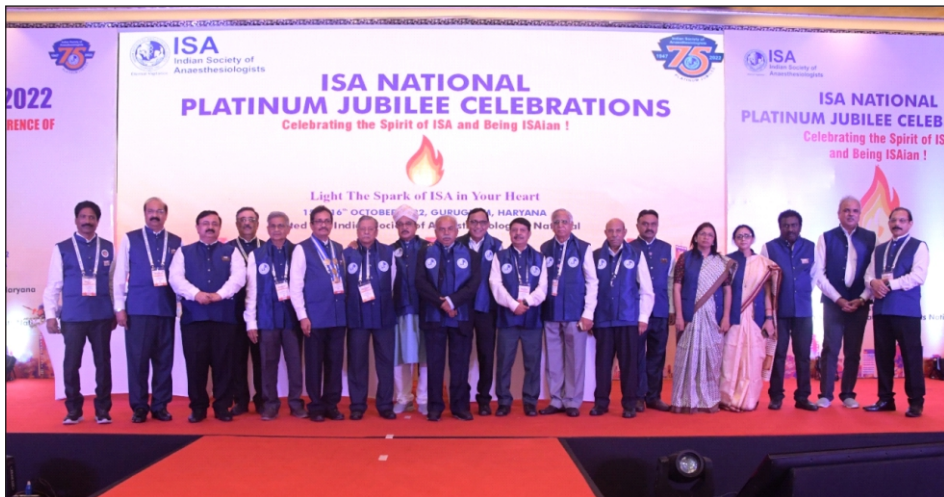
Felicitation Ceremony of ISA National Past Presidents ISA National Platinum Jubilee Celebrations, Gurugram, Haryana (15 October 2022)