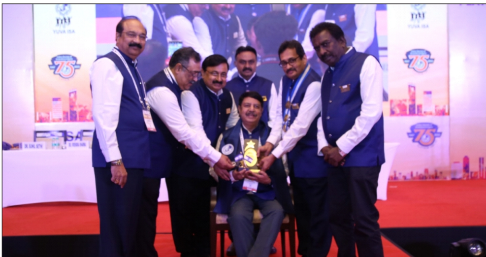
Felicitation of ISA National Past Presidents ISA National Platinum Jubilee Celebrations, Gurugram, Haryana (15 October 2022)