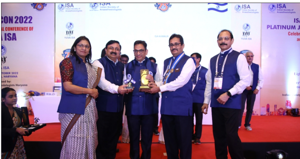
Felicitations of ISA State & City Branch Office Bearers ISA National Platinum Jubilee Celebrations, Gurugram, Haryana (15 October 2022)