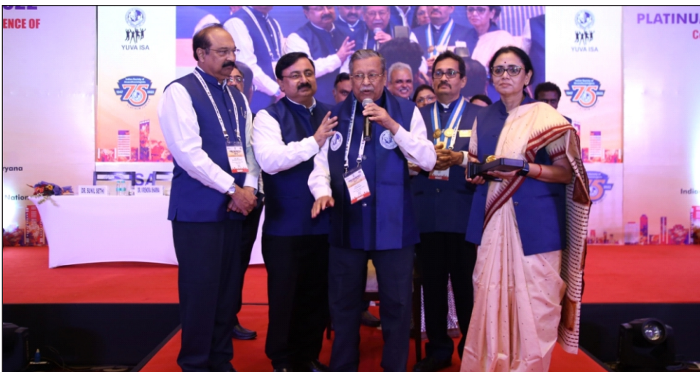
Felicitation of ISA National Past Presidents ISA National Platinum Jubilee Celebrations, Gurugram, Haryana (15 October 2022)