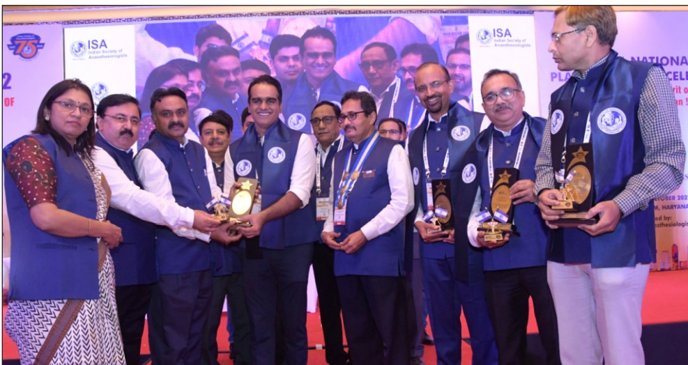
Felicitations of ISA State & City Branch Office Bearers ISA National Platinum Jubilee Celebrations, Gurugram, Haryana (15 October 2022)