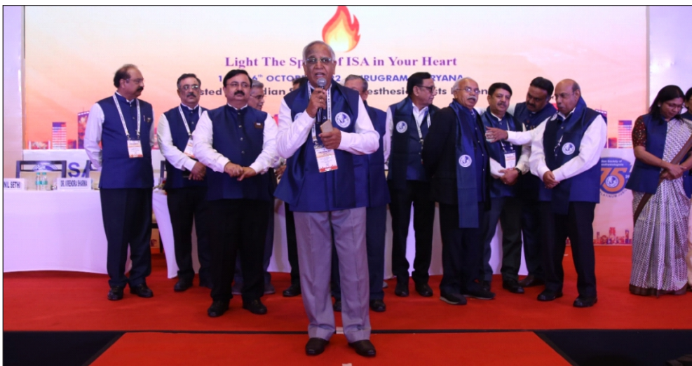
Felicitations of ISA National Past Presidents ISA National Platinum Jubilee Celebrations, Gurugram, Haryana (15 October 2022)