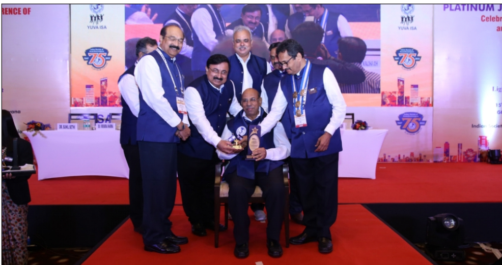
Felicitations of ISA National Past Presidents ISA National Platinum Jubilee Celebrations, Gurugram, Haryana (15 October 2022)