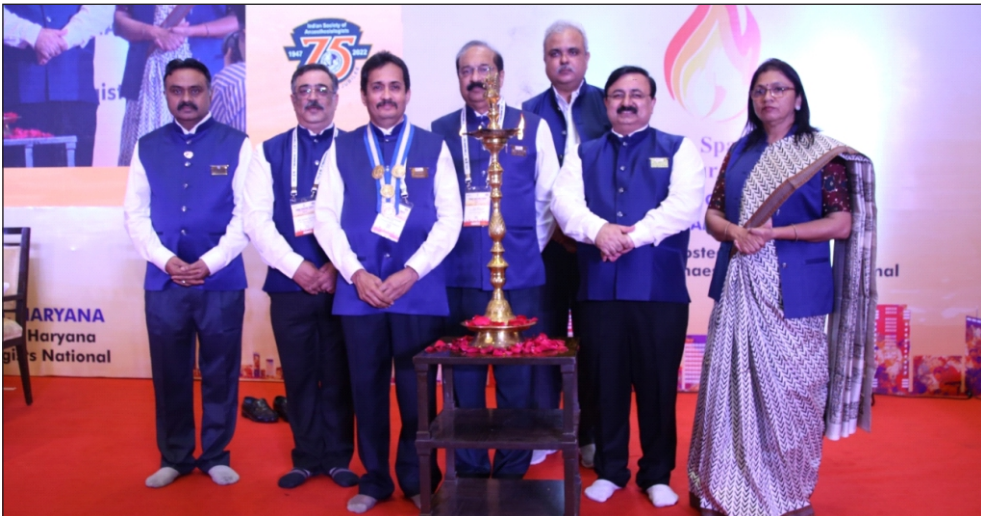
Inaugural Ceremony ISA National Platinum Jubilee Celebrations, Gurugram, Haryana (15 October 2022)