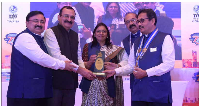
Felicitation of Past Vice President ISA National ISA National Platinum Jubilee Celebrations, Gurugram, Haryana (15 October 2022)