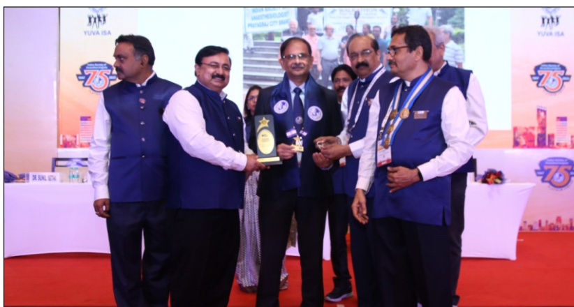
Felicitation of Past Editor-in-Chief IJA ISA National Platinum Jubilee Celebrations, Gurugram, Haryana (15 October 2022)