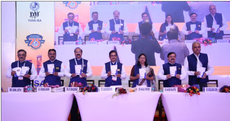
Release of Constitution Booklet ISA National Platinum Jubilee Celebrations, Gurugram, Haryana (15 October 2022)