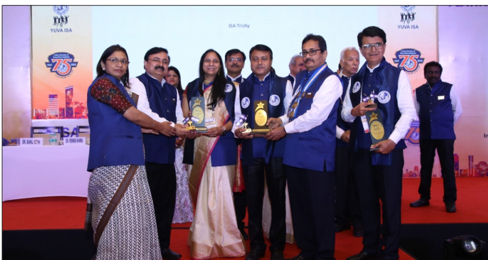
Felicitation of ISA State & City Branch Office Bearers ISA National Platinum Jubilee Celebrations, Gurugram, Haryana (15 October 2022)