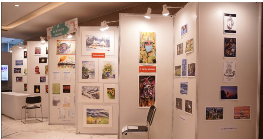
ISA Art & Literary Exhibition