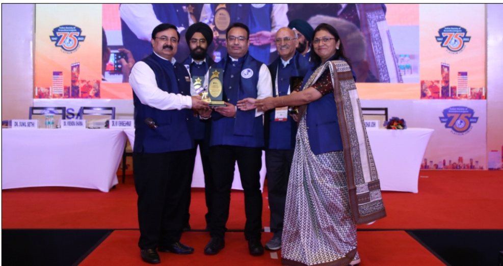
Felicitation of ISA State & City Branch Office Bearers ISA National Platinum Jubilee Celebrations, Gurugram, Haryana (15 October 2022)