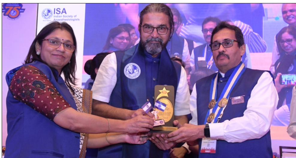
Felicitation of ISA State & City Branch Office Bearers ISA National Platinum Jubilee Celebrations, Gurugram, Haryana (15 October 2022)