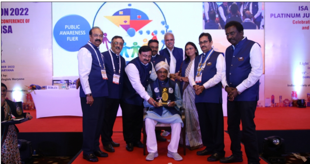
Felicitations of ISA National Past Presidents ISA National Platinum Jubilee Celebrations, Gurugram, Haryana (15 October 2022)