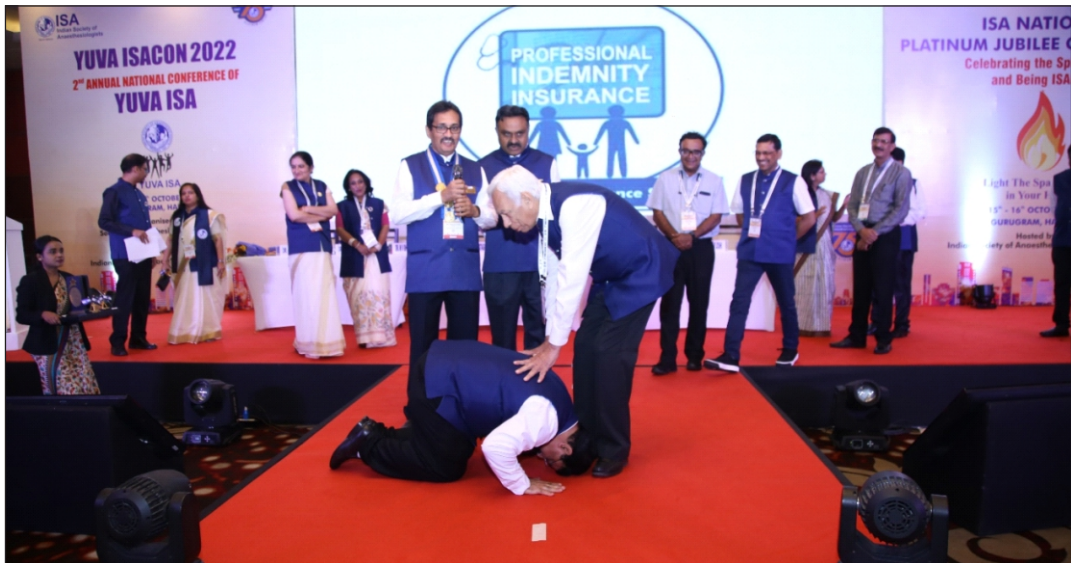
Felicitations of ISA State & City Branch Office Bearers ISA National Platinum Jubilee Celebrations, Gurugram, Haryana (15 October 2022)