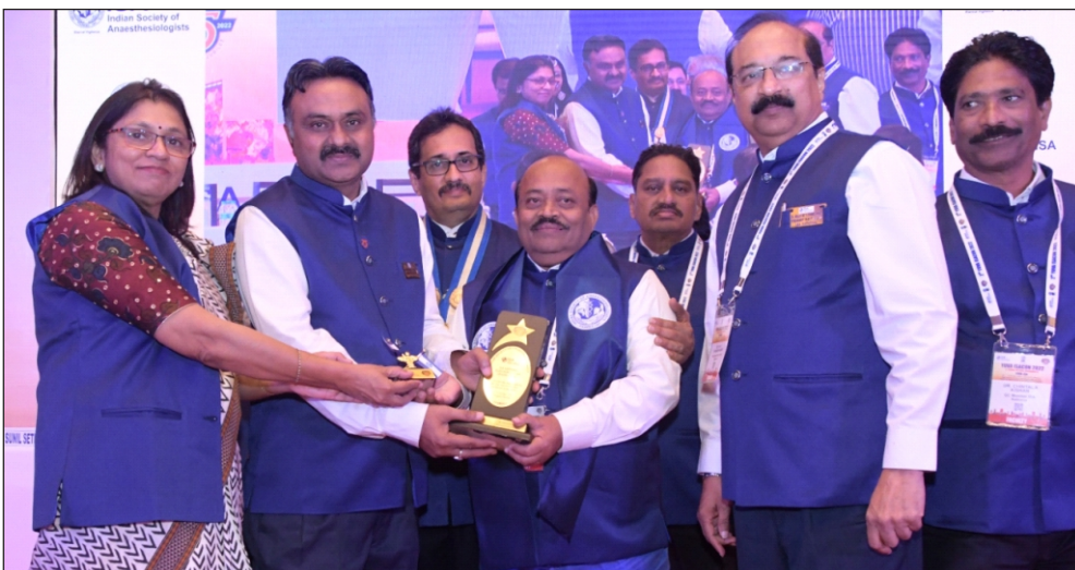
Felicitations of ISA State & City Branch Office Bearers ISA National Platinum Jubilee Celebrations, Gurugram, Haryana (15 October 2022)