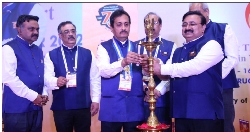
Inaugural Ceremony ISA National Platinum Jubilee Celebrations, Gurugram, Haryana (15 October 2022)