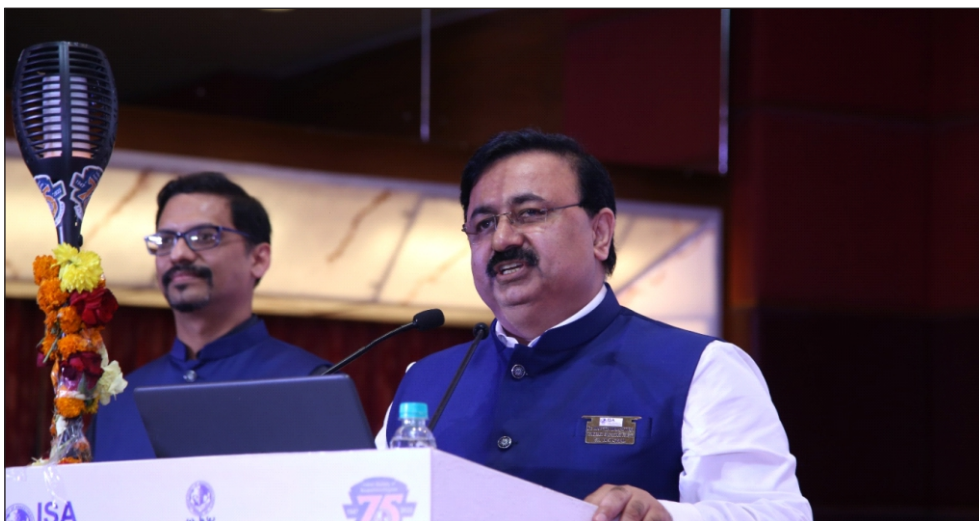
Inaugural Ceremony ISA National Platinum Jubilee Celebrations, Gurugram, Haryana (15 October 2022)