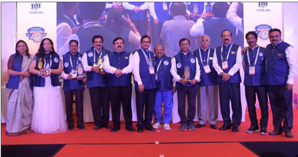
Felicitation of ISA State & City Branch Office Bearers ISA National Platinum Jubilee Celebrations, Gurugram, Haryana (15 October 2022)