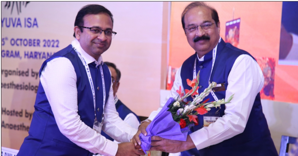
Inaugural Ceremony ISA National Platinum Jubilee Celebrations, Gurugram, Haryana (15 October 2022)