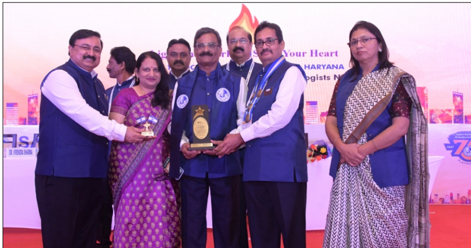
Felicitation of Past Vice President ISA National ISA National Platinum Jubilee Celebrations, Gurugram, Haryana (15 October 2022)