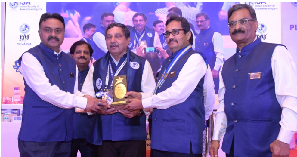
Felicitation of ISA State & City Branch Office Bearers ISA National Platinum Jubilee Celebrations, Gurugram, Haryana (15 October 2022)