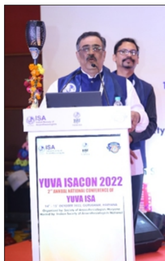
Inaugural Ceremony ISA National Platinum Jubilee Celebrations, Gurugram, Haryana (15 October 2022)