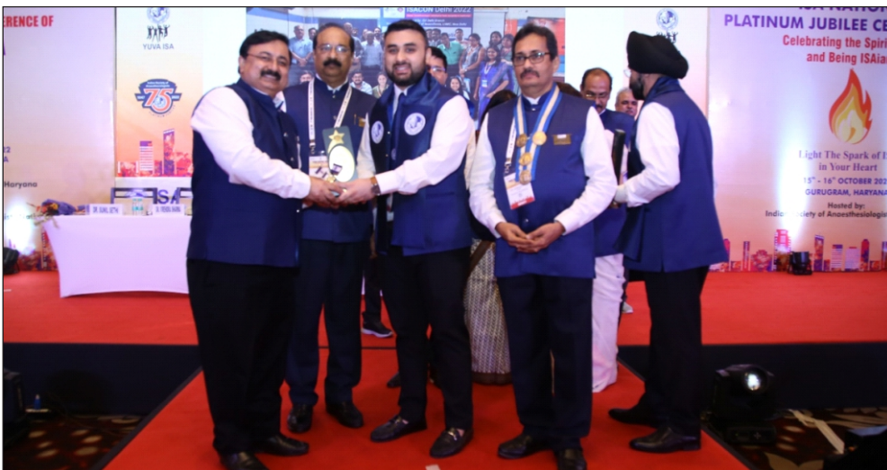
Felicitation of ISA State & City Branch Office Bearers ISA National Platinum Jubilee Celebrations, Gurugram, Haryana (15 October 2022)