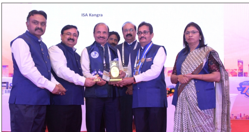
Felicitation of Past ISA National Governing Council Member ISA National Platinum Jubilee Celebrations, Gurugram, Haryana (15 October 2022)