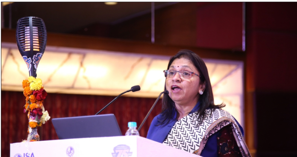
Inaugural Ceremony ISA National Platinum Jubilee Celebrations, Gurugram, Haryana (15 October 2022)