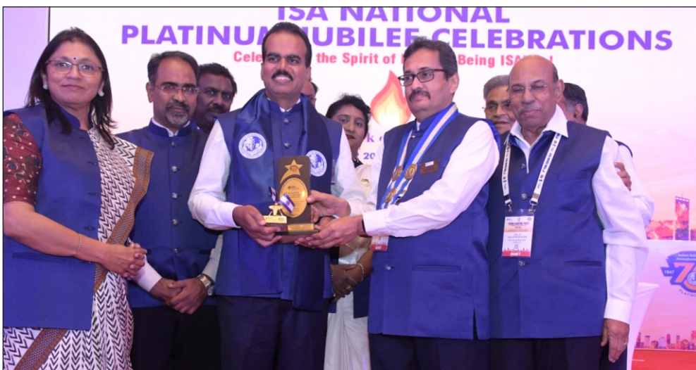
Felicitation of ISA State & City Branch Office Bearers ISA National Platinum Jubilee Celebrations, Gurugram, Haryana (15 October 2022)