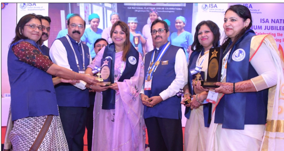
Felicitations of ISA State & City Branch Office Bearers ISA National Platinum Jubilee Celebrations, Gurugram, Haryana (15 October 2022)