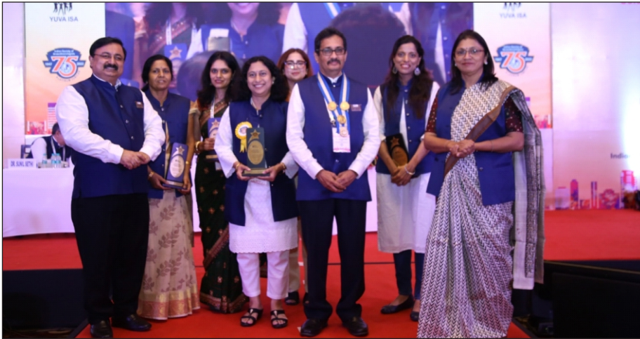
Release of Public Awareness Video ISA National Platinum Jubilee Celebrations, Gurugram, Haryana (15 October 2022)