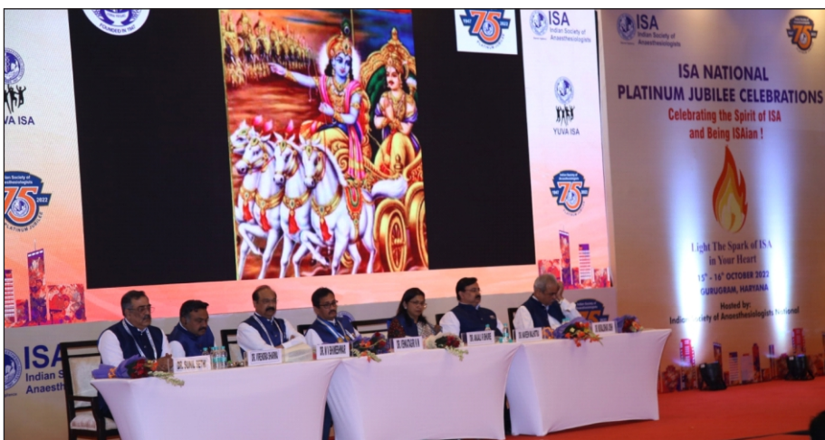
Release of Public Awareness Video ISA National Platinum Jubilee Celebrations, Gurugram, Haryana (15 October 2022)