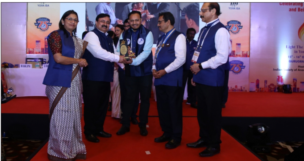
Felicitation of ISA State & City Branch Office Bearers ISA National Platinum Jubilee Celebrations, Gurugram, Haryana (15 October 2022)