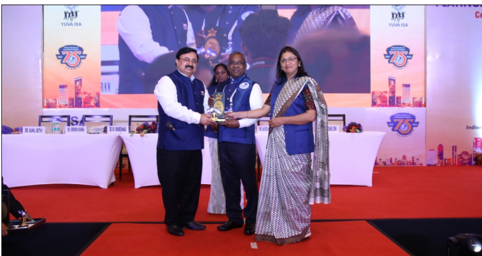
Felicitations of ISA State & City Branch Office Bearers ISA National Platinum Jubilee Celebrations, Gurugram, Haryana (15 October 2022)