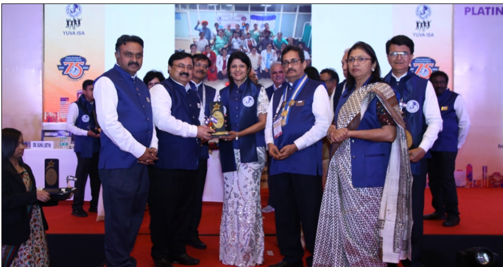
Felicitation of ISA State & City Branch Office Bearers ISA National Platinum Jubilee Celebrations, Gurugram, Haryana (15 October 2022)