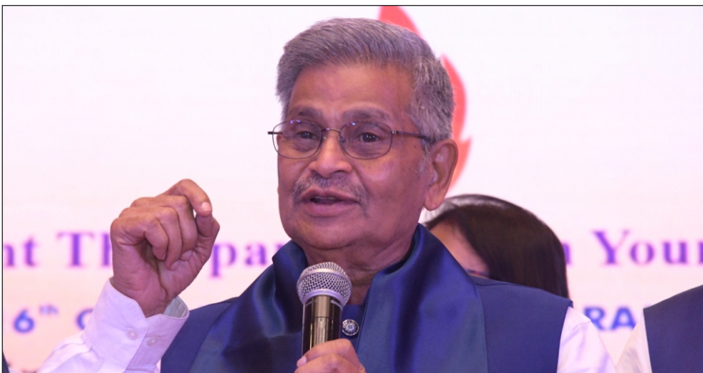
Felicitation of ISA National Past Presidents ISA National Platinum Jubilee Celebrations, Gurugram, Haryana (15 October 2022)