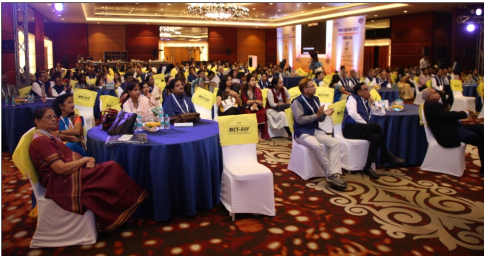
ISA National Platinum Jubilee Celebrations Gurugram, Haryana (15 October 2022)