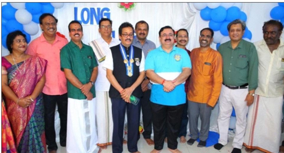
Inauguration of ISA National Registered Office (ISA Balakrishnan House), Chennai (15 May 2022)