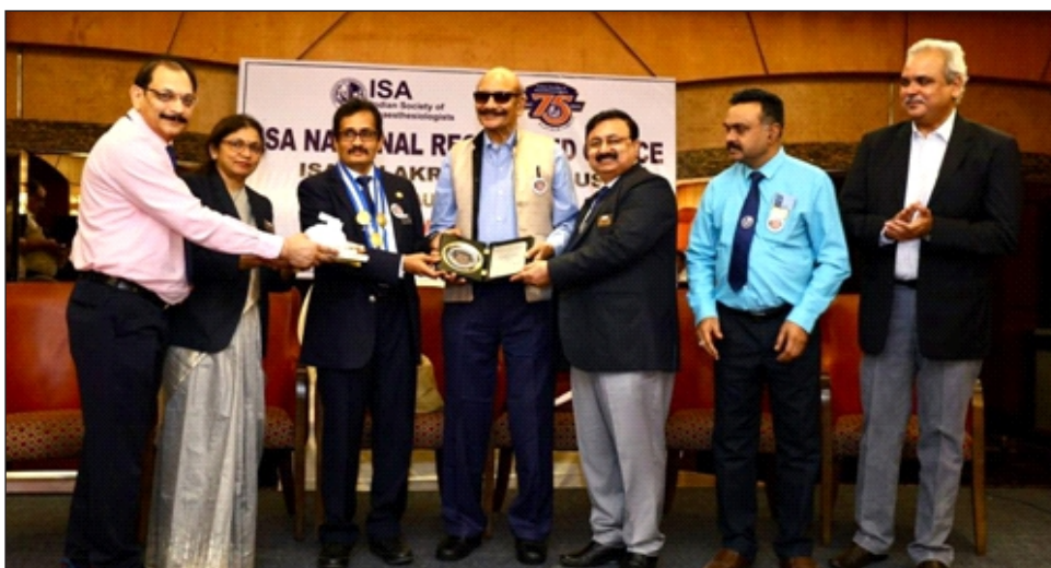
Felicitation Ceremony ISA National Registered Office (ISA Balakrishnan House), Chennai (14 May 2022)