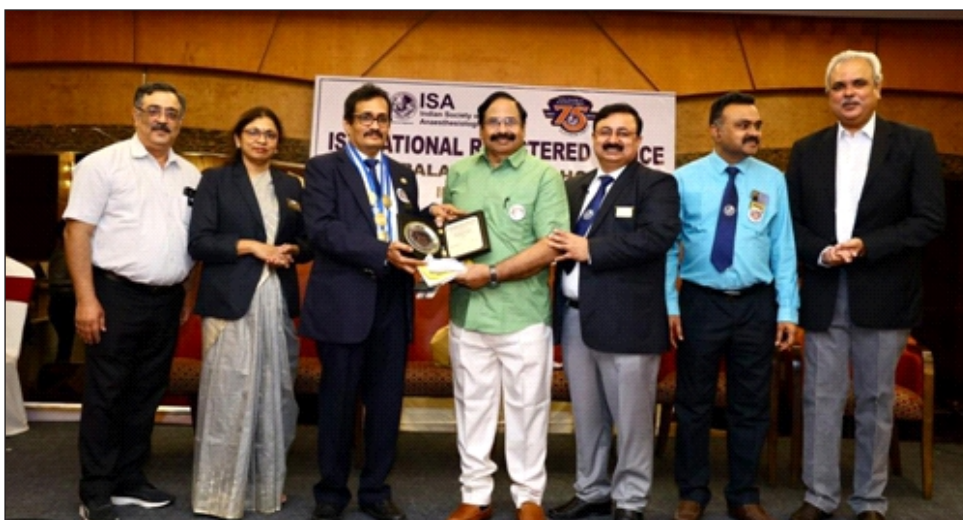
Felicitation Ceremony ISA National Registered Office (ISA Balakrishnan House), Chennai (14 May 2022)