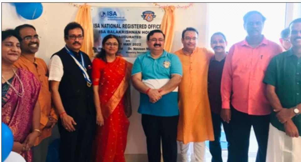
Inauguration of ISA National Registered Office (ISA Balakrishnan House), Chennai (15 May 2022)