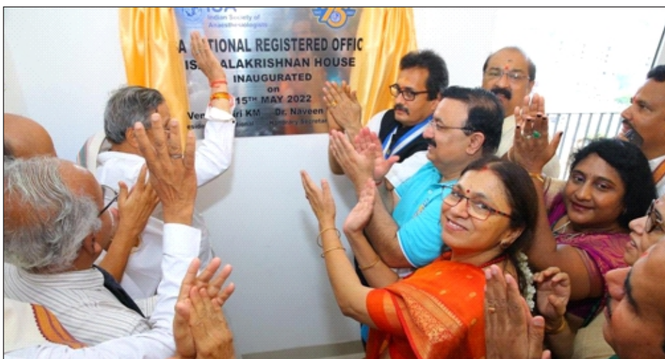
Inauguration of ISA National Registered Office (ISA Balakrishnan House), Chennai (15 May 2022)