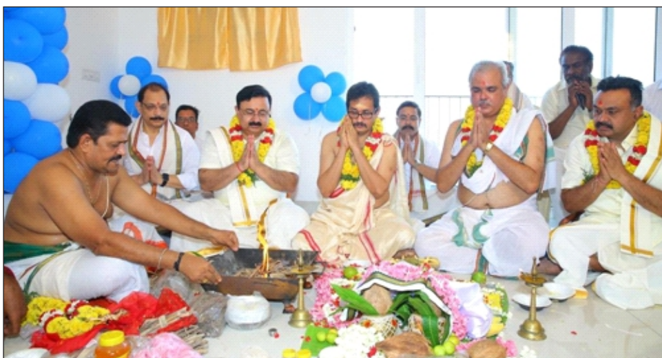
Inauguration of ISA National Registered Office (ISA Balakrishnan House), Chennai (15 May 2022)