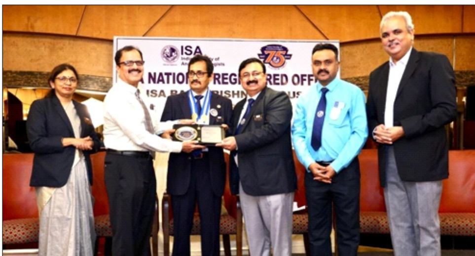
Felicitation Ceremony ISA National Registered Office (ISA Balakrishnan House), Chennai (14 May 2022)