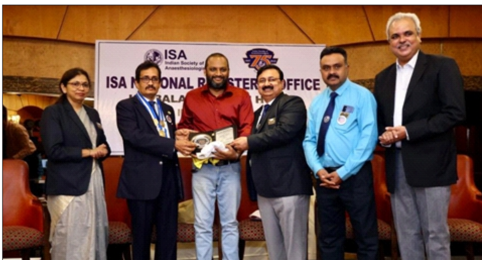
Felicitation Ceremony ISA National Registered Office (ISA Balakrishnan House), Chennai (14 May 2022)