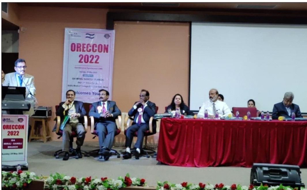
ISA CME, Sangli-Miraj (29 May 2022)