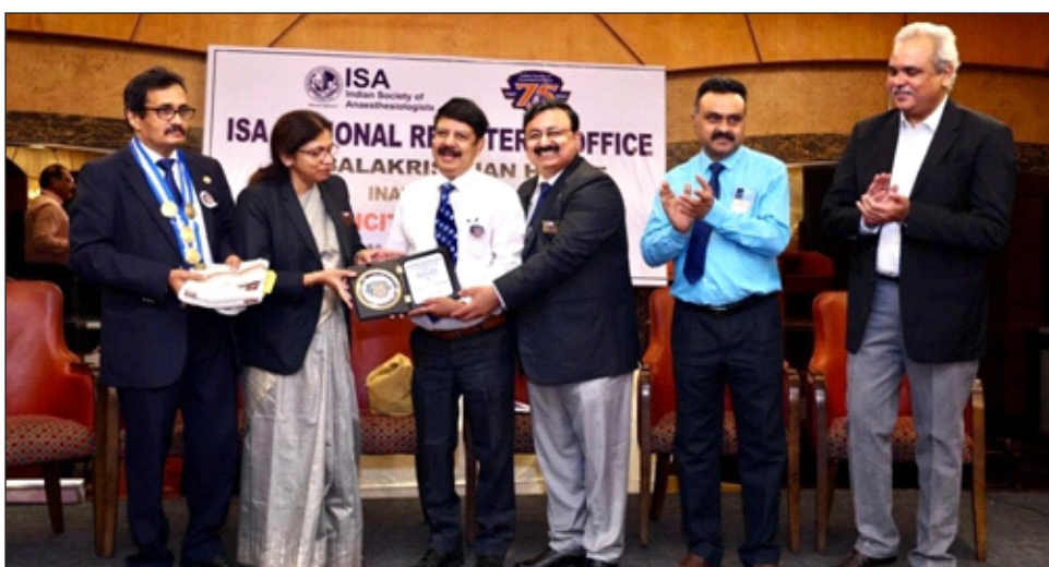
Felicitation Ceremony ISA National Registered Office (ISA Balakrishnan House), Chennai (14 May 2022)