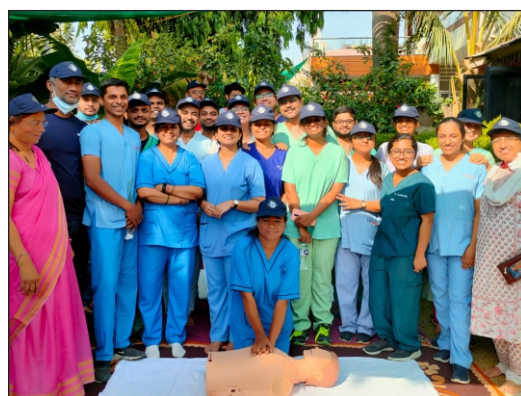
Walk-A-Thon organized by City Branches of ISA Maharashtra State Chapter Dedicated to Public Awareness & COLS Demonstration as a part of ISA Platinum Jubilee Celebrations (1 May 2022)