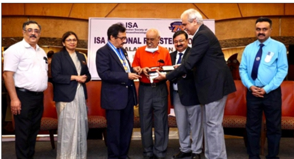
Felicitation Ceremony ISA National Registered Office (ISA Balakrishnan House), Chennai (14 May 2022)