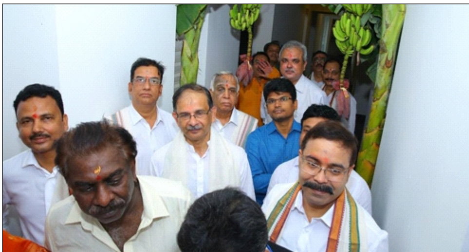
Inauguration of ISA National Registered Office (ISA Balakrishnan House), Chennai (15 May 2022)