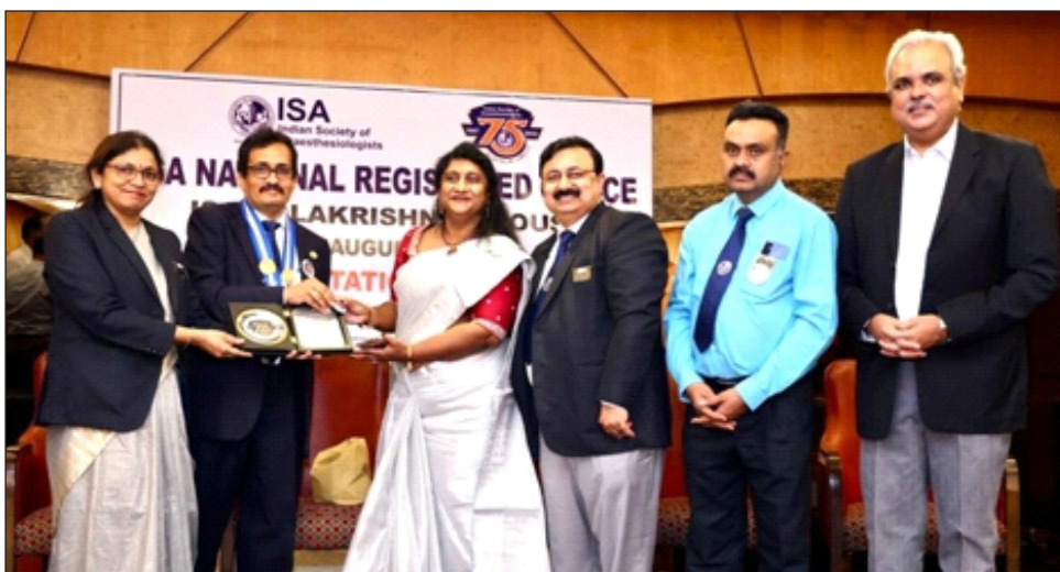
Felicitation Ceremony ISA National Registered Office (ISA Balakrishnan House), Chennai (14 May 2022)