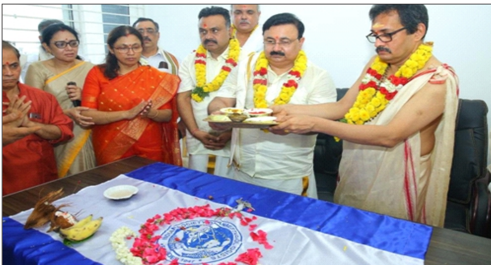
Inauguration of ISA National Registered Office (ISA Balakrishnan House), Chennai (15 May 2022)