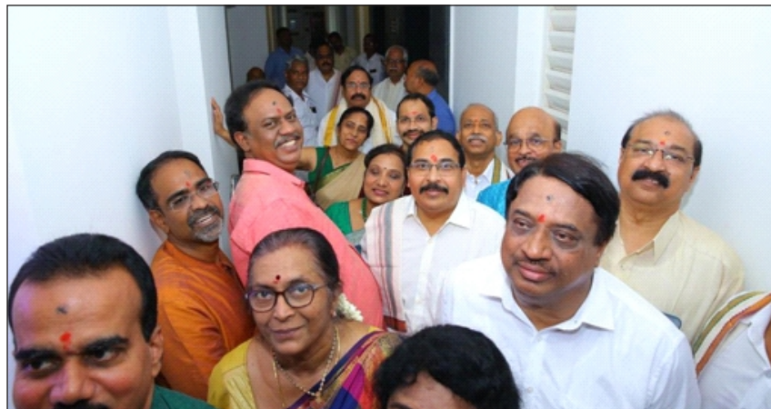
Inauguration of ISA National Registered Office (ISA Balakrishnan House), Chennai (15 May 2022)