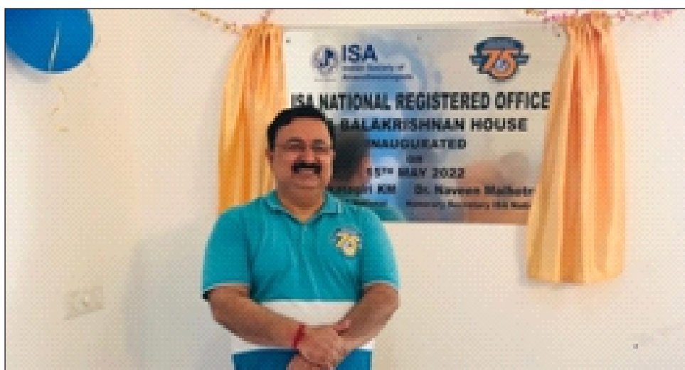
Inauguration of ISA National Registered Office (ISA Balakrishnan House), Chennai (15 May 2022)