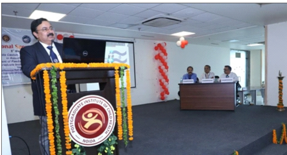
ISA CME Noida GB Nagar (8 May 2022)