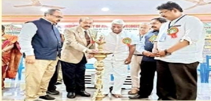
జ్యోతి ప్రజ్వలన చేసి సదస్సును ప్రారంభిస్తున్న వైద్యులు