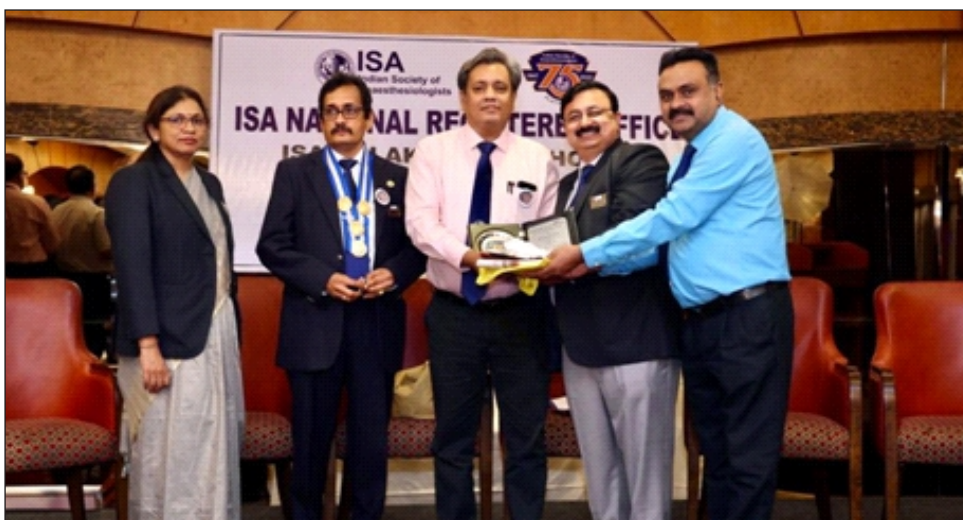
Felicitation Ceremony ISA National Registered Office (ISA Balakrishnan House), Chennai (14 May 2022)