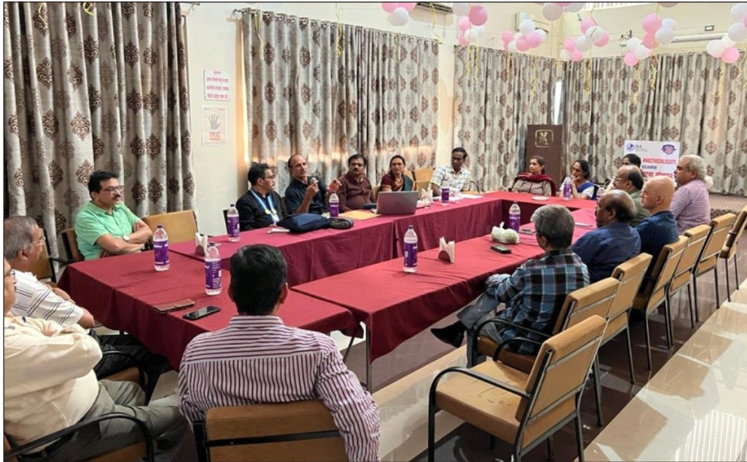
ISA Kolhapur Meeting 28 May 2022