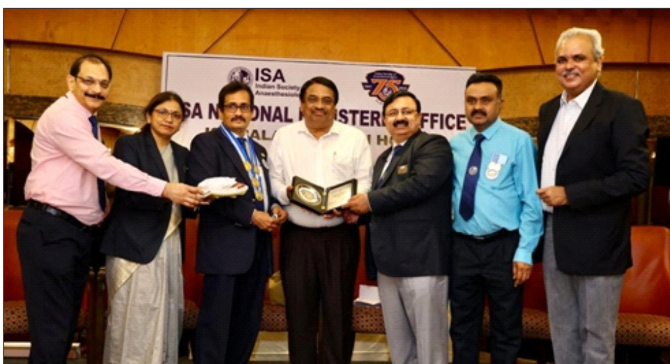
Felicitation Ceremony ISA National Registered Office (ISA Balakrishnan House), Chennai (14 May 2022)