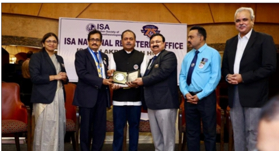
Felicitation Ceremony ISA National Registered Office (ISA Balakrishnan House), Chennai (14 May 2022)