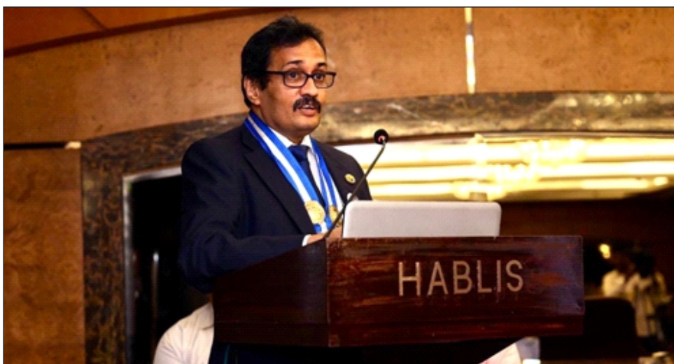
Felicitation Ceremony ISA National Registered Office (ISA Balakrishnan House), Chennai (14 May 2022)