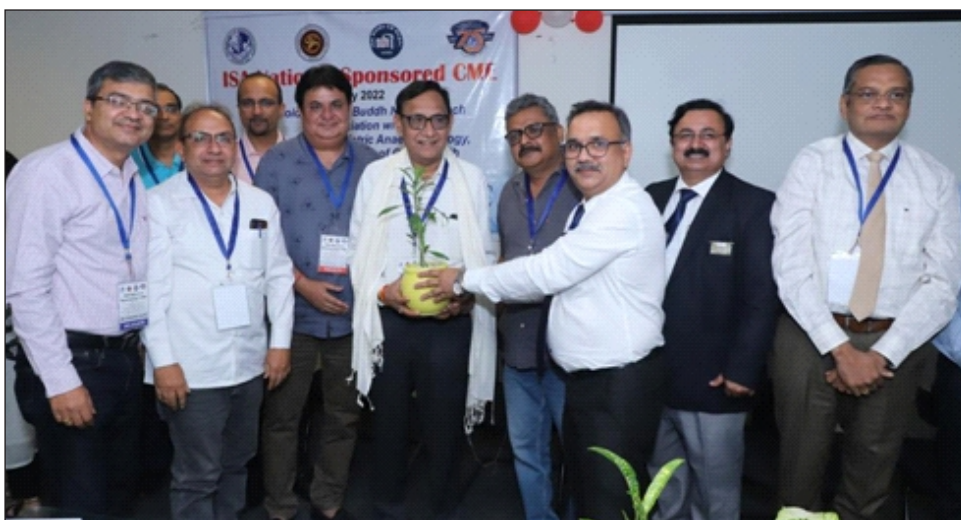
ISA CME Noida GB Nagar (8 May 2022)