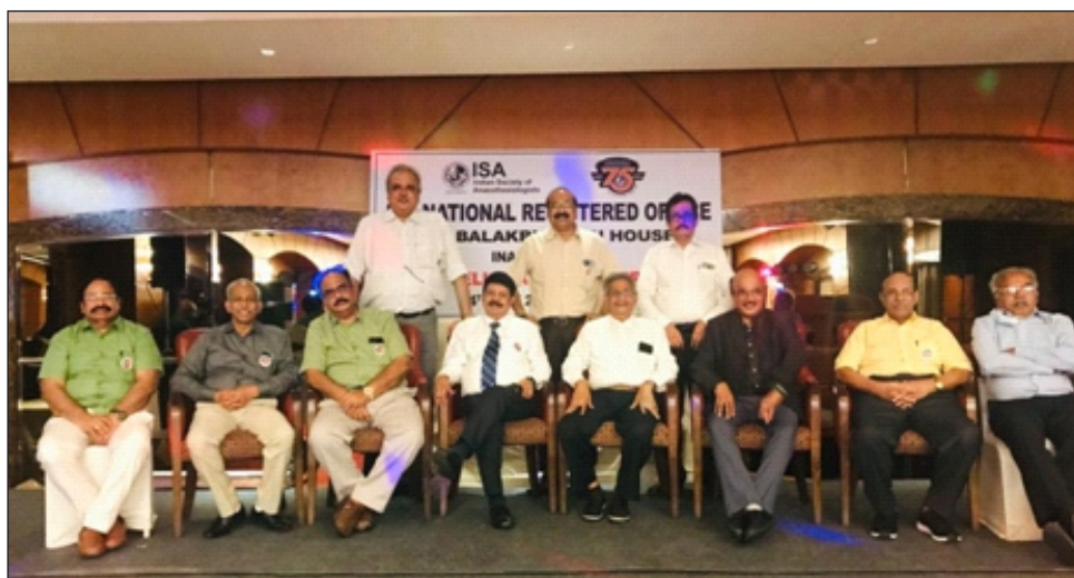
Felicitation Ceremony ISA National Registered Office (ISA Balakrishnan House), Chennai (14 May 2022)