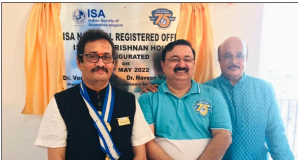
Inauguration of ISA National Registered Office (ISA Balakrishnan House), Chennai (15 May 2022)