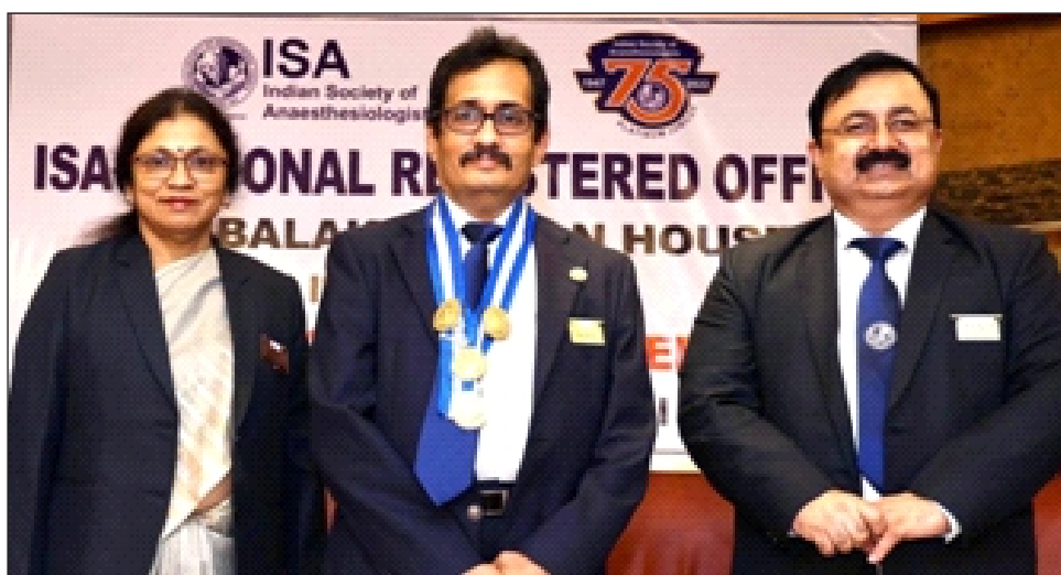
Felicitation Ceremony - ISA National Registered Office (ISA House), Chennai (14 May 2022)