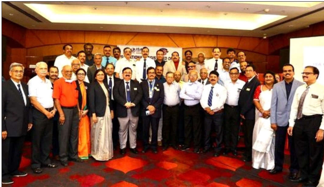
Felicitations Ceremony ISA National Registered Office (ISA Balakrishnan House), Chennai (14 May 2022)