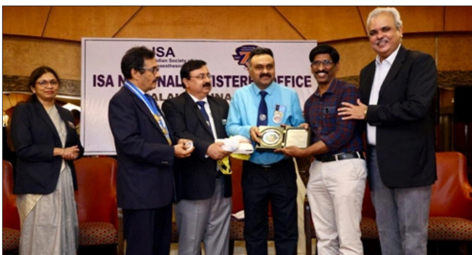
Felicitation Ceremony ISA National Registered Office (ISA Balakrishnan House), Chennai (14 May 2022)