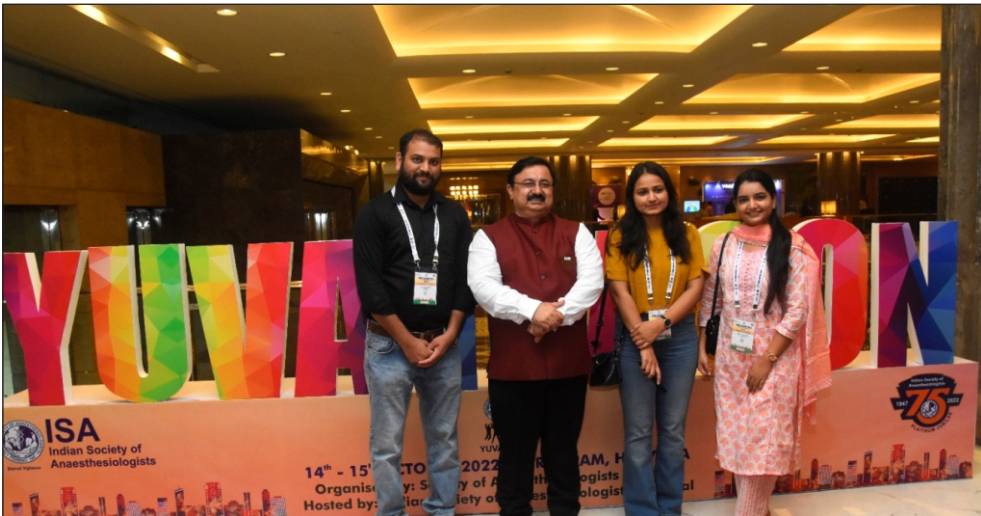
2 nd National YUVA ISACON 2022, Haryana (14-15 October 2022)