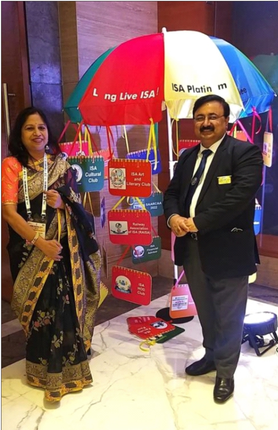
ISA UMBRELLA 2 nd National YUVA ISACON 2022, Haryana (14-15 October 2022)