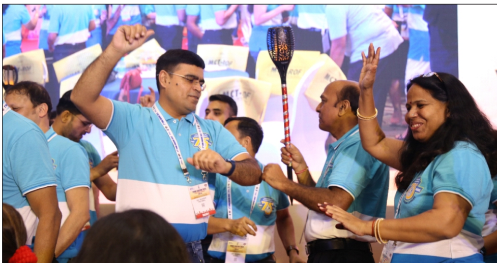
Culmination of ISA Flame Event ISA National Platinum Jubilee Celebrations, Gurugram, Haryana (15 October 2022)