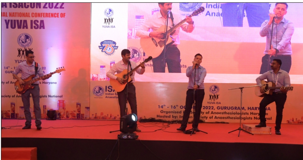
ISA YUVA KALA (Cultural Program) 2 nd National YUVA ISACON 2022, Haryana (14-15 October 2022)