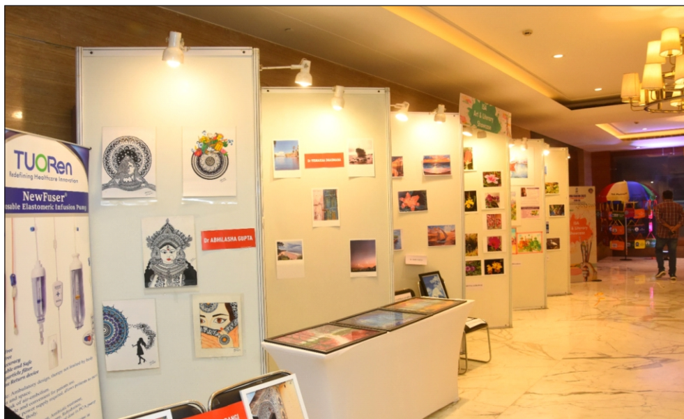
ISA ART & LITERARY CLUB SHOWCASE 2 nd National YUVA ISACON 2022, Haryana (14-15 October 2022)