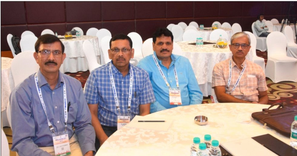
2 nd National YUVA ISACON 2022, Haryana (14-15 October 2022)