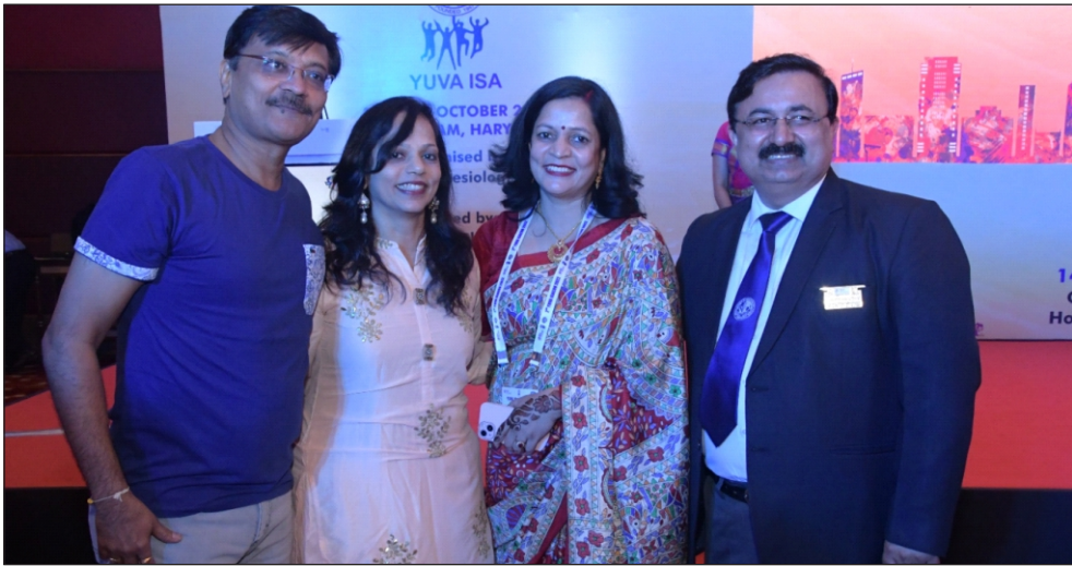
2 nd National YUVA ISACON 2022, Haryana (14-15 October 2022)