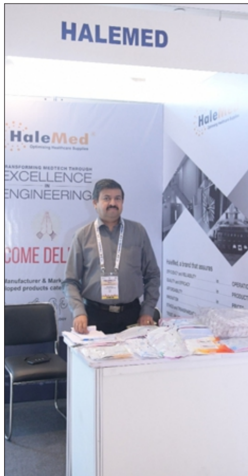
Trade & Industry Exhibition 2 nd National YUVA ISACON 2022, Haryana (14-15 October 2022)