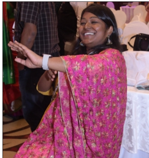
ISA YUVA KALA (Cultural Program) 2 nd National YUVA ISACON 2022, Haryana (14-15 October 2022)