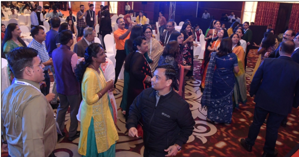
ISA YUVA KALA (Cultural Program) 2 nd National YUVA ISACON 2022, Haryana (14-15 October 2022)