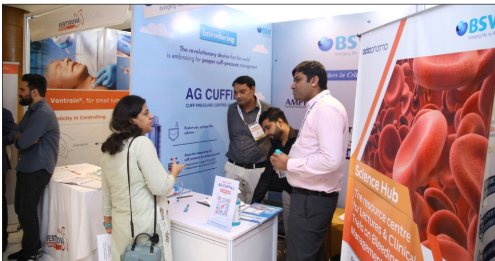
Trade & Industry Exhibition 2 nd National YUVA ISACON 2022, Haryana (14-15 October 2022)