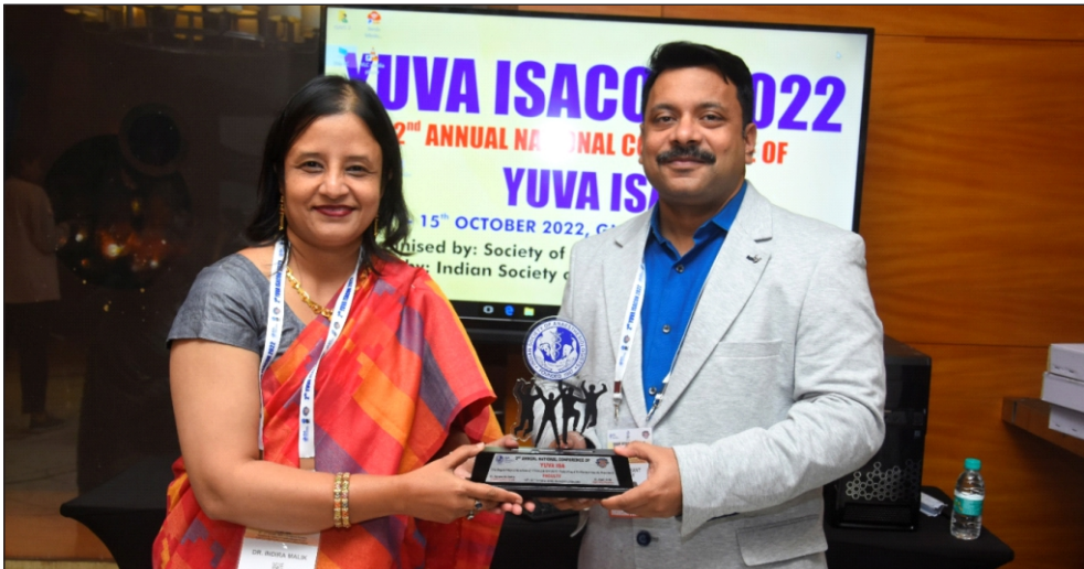
Paper & Poster Session 2 nd National YUVA ISACON 2022, Haryana (14-15 October 2022)