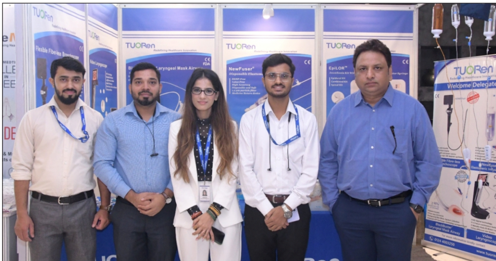
Trade & Industry Exhibition 2 nd National YUVA ISACON 2022, Haryana (14-15 October 2022)