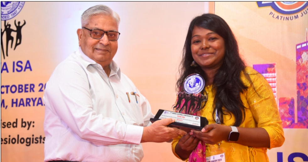
Paper & Poster Session 2 nd National YUVA ISACON 2022, Haryana (14-15 October 2022)