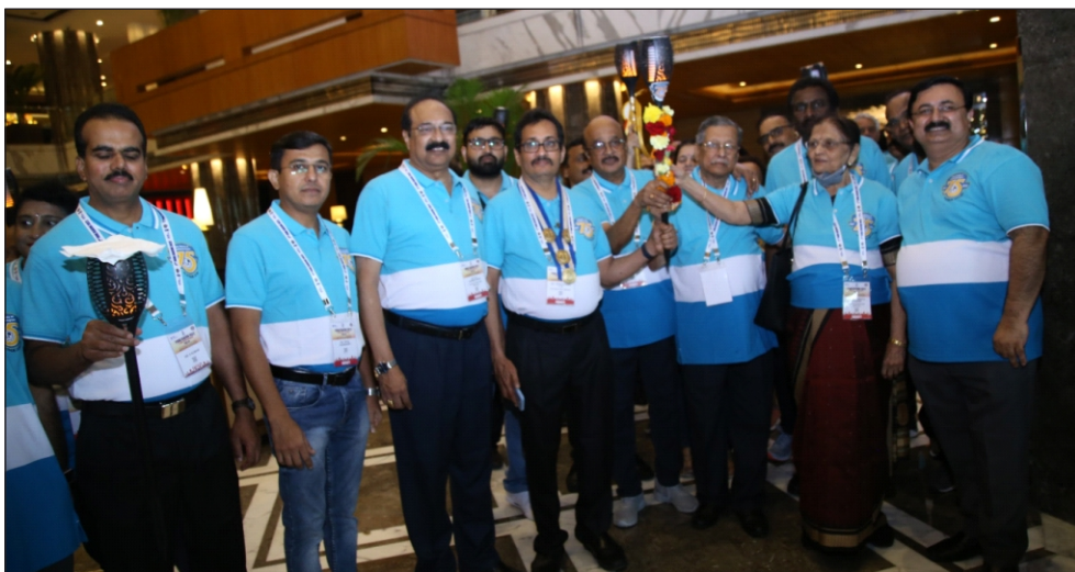
Culmination of ISA Flame Event ISA National Platinum Jubilee Celebrations, Gurugram, Haryana (15 October 2022)