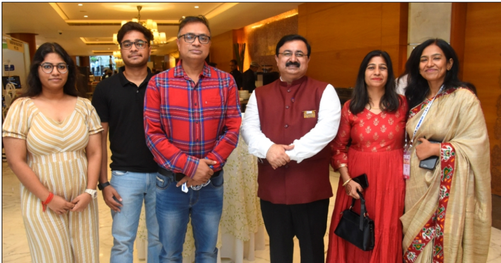
2 nd National YUVA ISACON 2022, Haryana (14-15 October 2022)