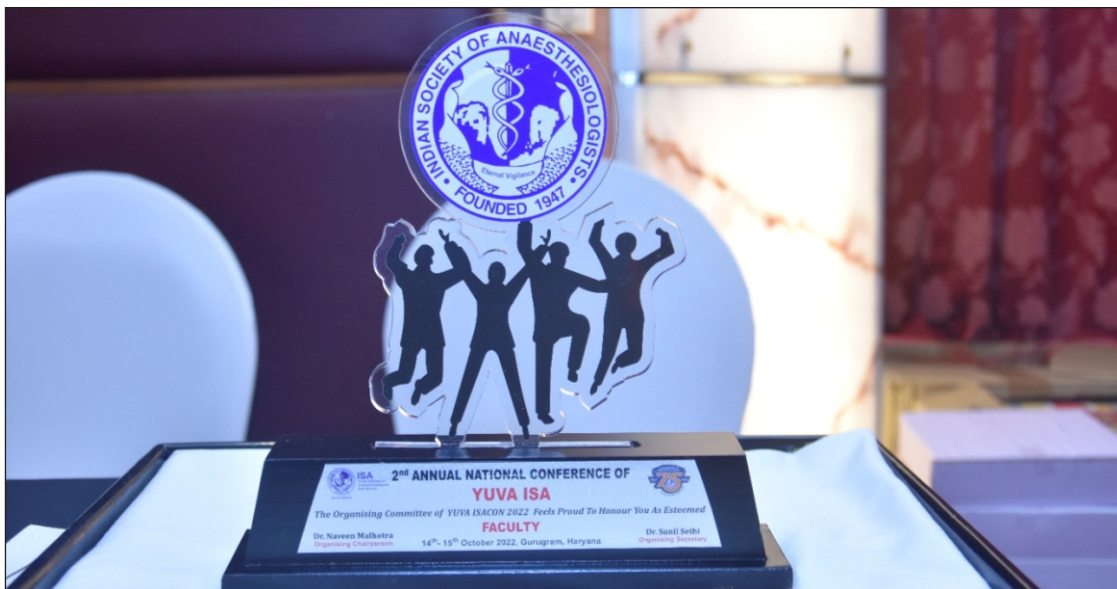
2 nd National YUVA ISACON 2022, Haryana (14-15 October 2022)