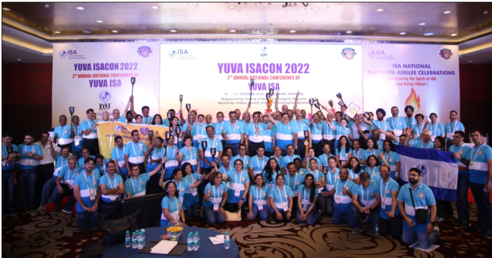
Culmination of ISA Flame Event ISA National Platinum Jubilee Celebrations, Gurugram, Haryana (15 October 2022)