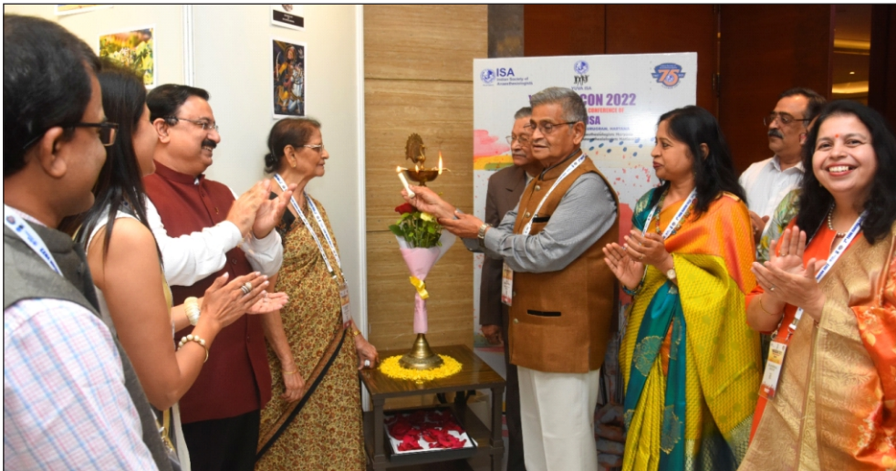
ISA ART & LITERARY CLUB SHOWCASE 2 nd National YUVA ISACON 2022, Haryana (14-15 October 2022)