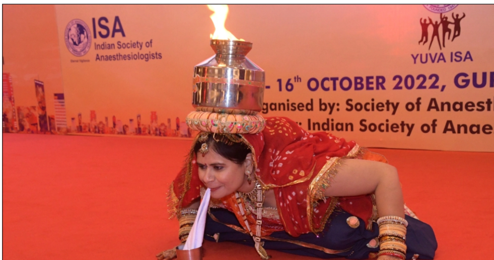
ISA YUVA KALA (Cultural Program) 2 nd National YUVA ISACON 2022, Haryana (14-15 October 2022)