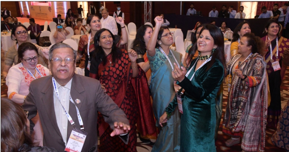
ISA YUVA KALA (Cultural Program) 2 nd National YUVA ISACON 2022, Haryana (14-15 October 2022)