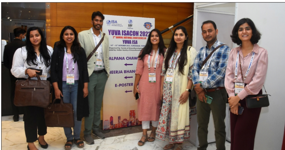
Paper & Poster Session 2 nd National YUVA ISACON 2022, Haryana (14-15 October 2022)