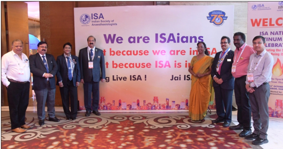
2 nd National YUVA ISACON 2022, Haryana (14-15 October 2022)