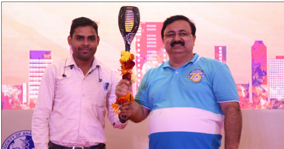
Culmination of ISA Flame Event ISA National Platinum Jubilee Celebrations, Gurugram, Haryana (15 October 2022)