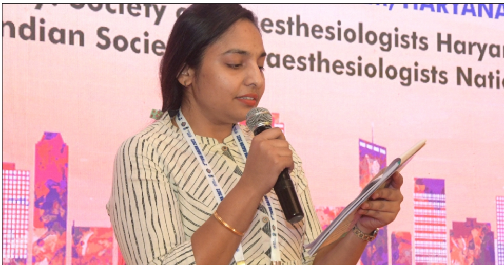
ISA YUVA KALA (Cultural Program) 2 nd National YUVA ISACON 2022, Haryana (14-15 October 2022)