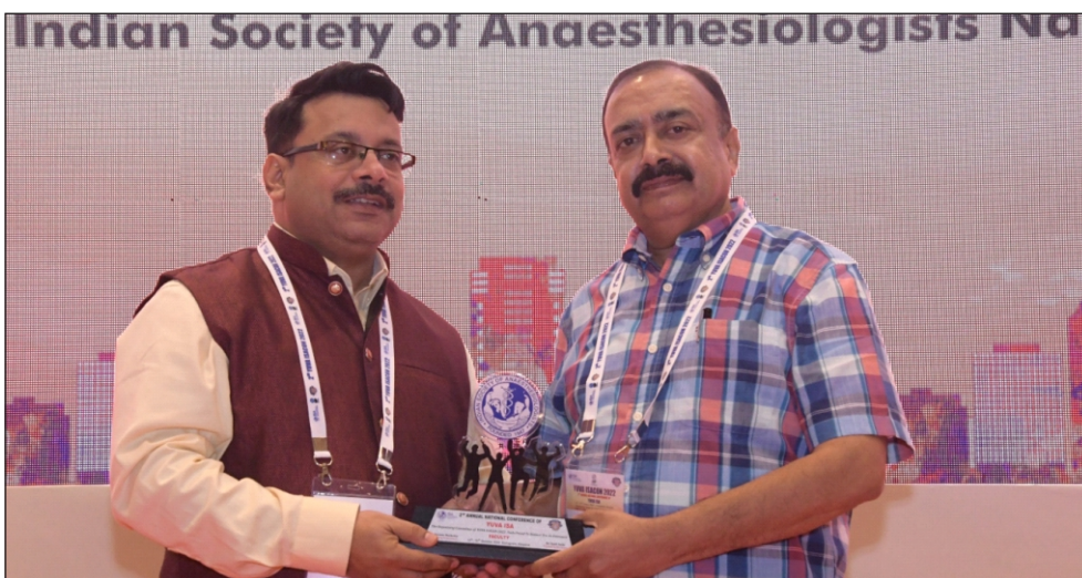
Paper & Poster Session 2 nd National YUVA ISACON 2022, Haryana (14-15 October 2022)