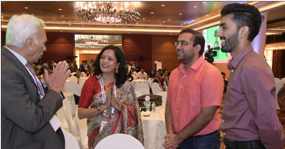
ISA YUVA KALA (Cultural Program) 2 nd National YUVA ISACON 2022, Haryana (14-15 October 2022)