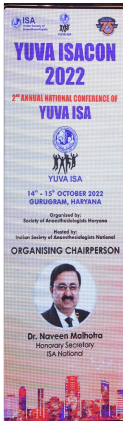
2 nd National YUVA ISACON 2022, Haryana (14-15 October 2022)