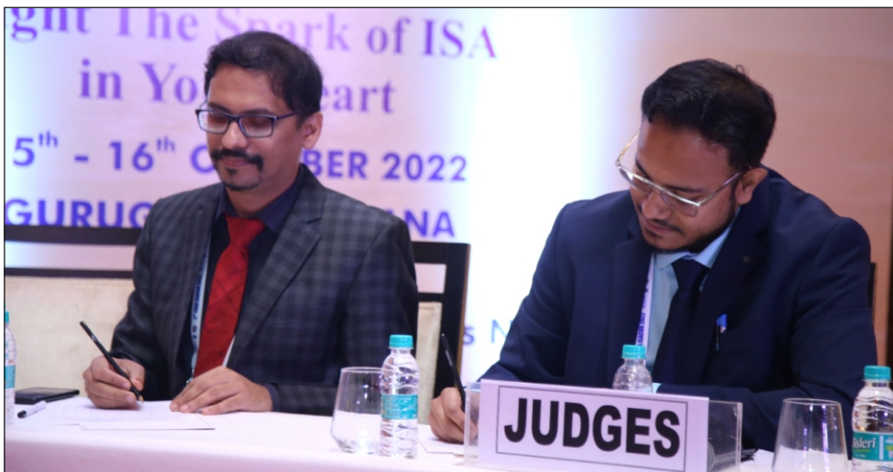
Paper & Poster Session 2 nd National YUVA ISACON 2022, Haryana (14-15 October 2022)