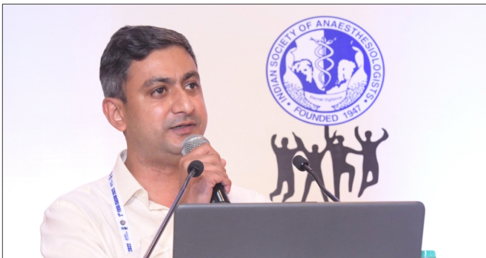
ISA YUVA KALA (Cultural Program) 2 nd National YUVA ISACON 2022, Haryana (14-15 October 2022)