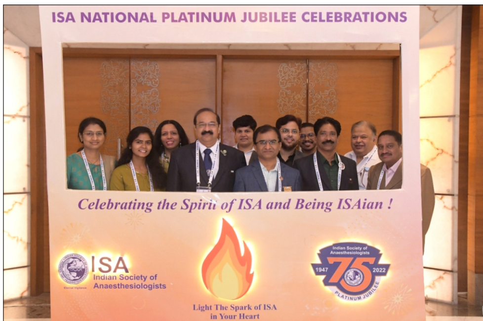
2 nd National YUVA ISACON 2022, Haryana (14-15 October 2022)