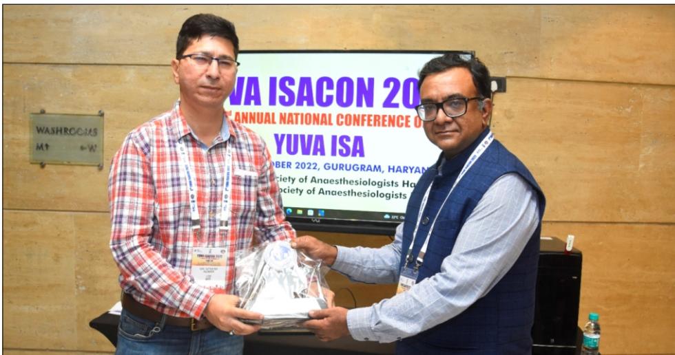
Paper & Poster Session 2 nd National YUVA ISACON 2022, Haryana (14-15 October 2022)