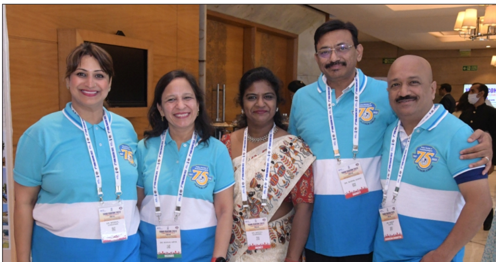
2 nd National YUVA ISACON 2022, Haryana (14-15 October 2022)