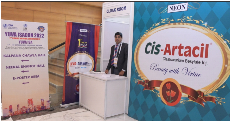
Trade & Industry Exhibition 2 nd National YUVA ISACON 2022, Haryana (14-15 October 2022)