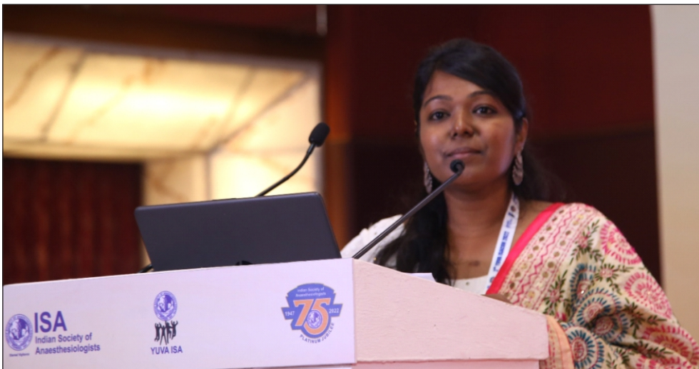
ISA Innovation Session 2 nd National YUVA ISACON 2022, Haryana (14-15 October 2022)