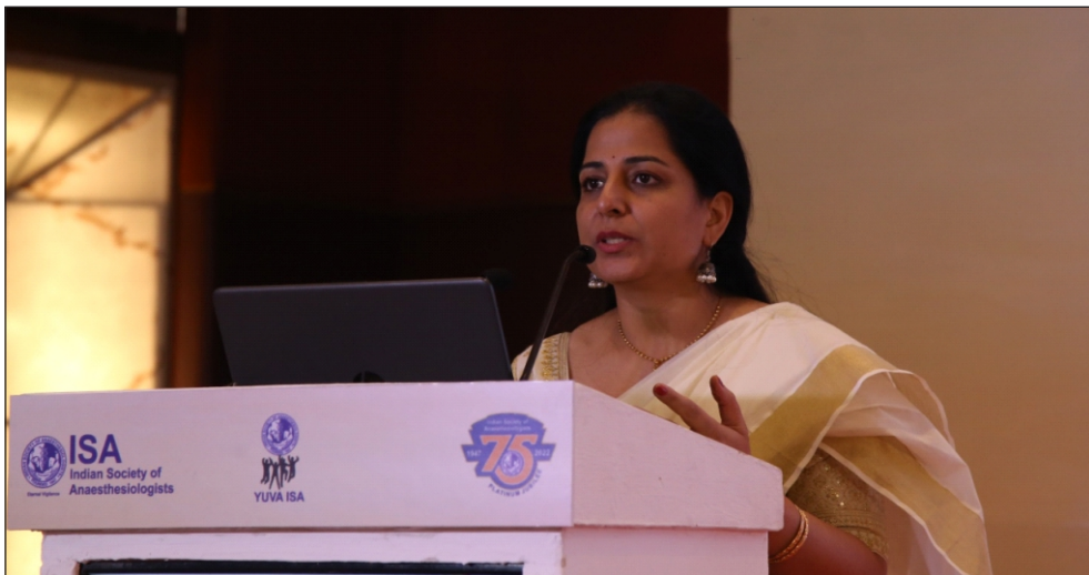
ISA Innovation Session 2 nd National YUVA ISACON 2022, Haryana (14-15 October 2022)