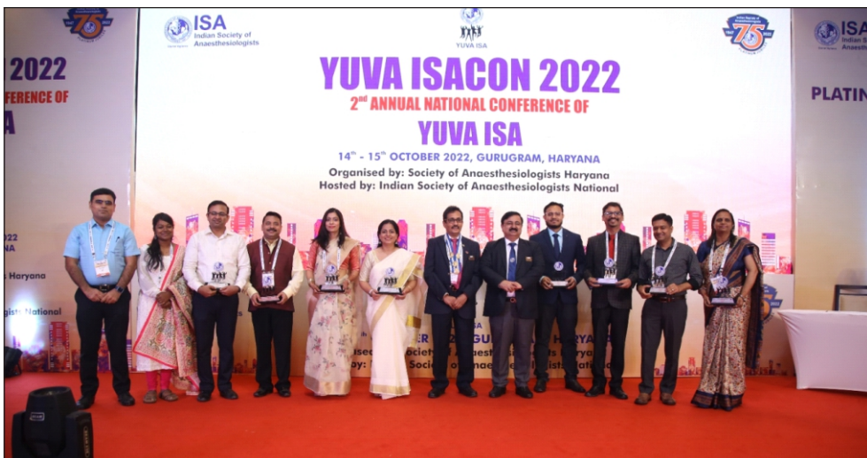
ISA Innovation Session 2 nd National YUVA ISACON 2022, Haryana (14-15 October 2022)