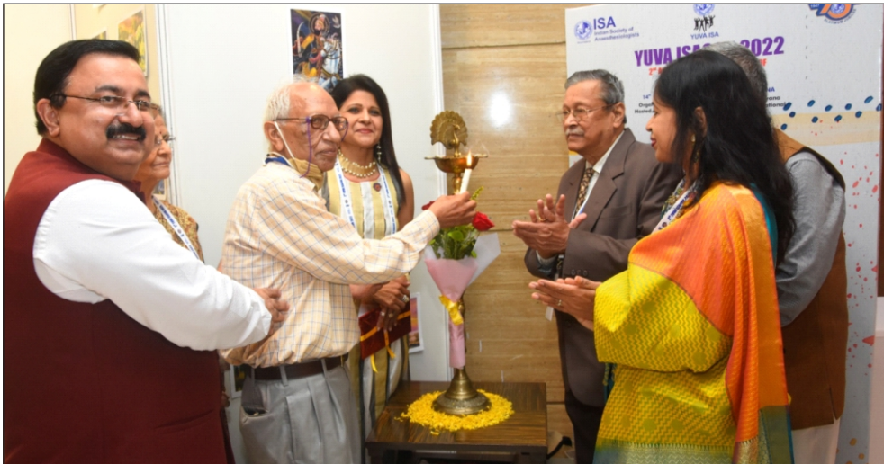
ISA ART & LITERARY CLUB SHOWCASE 2 nd National YUVA ISACON 2022, Haryana (14-15 October 2022)