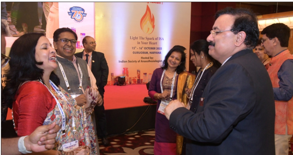
ISA YUVA KALA (Cultural Program) 2 nd National YUVA ISACON 2022, Haryana (14-15 October 2022)