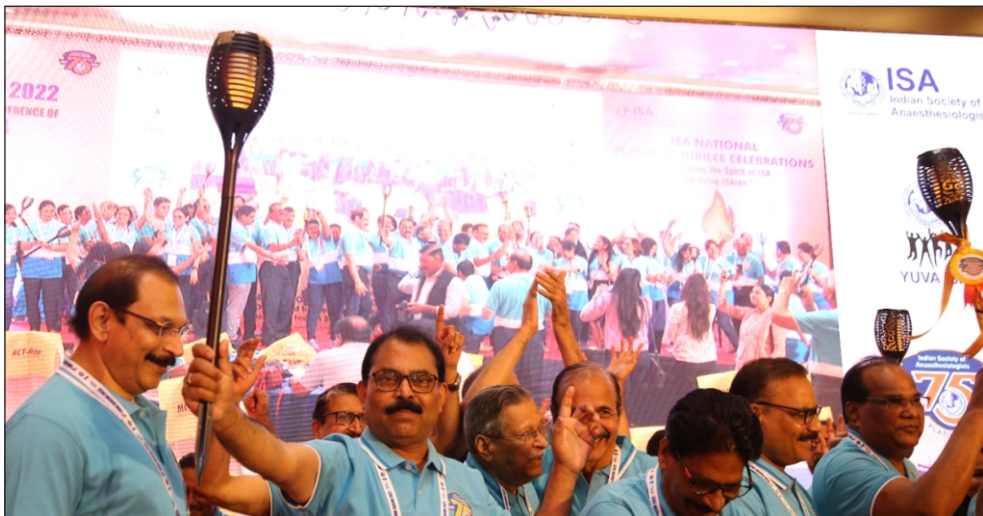
Culmination of ISA Flame Event ISA National Platinum Jubilee Celebrations, Gurugram, Haryana (15 October 2022)