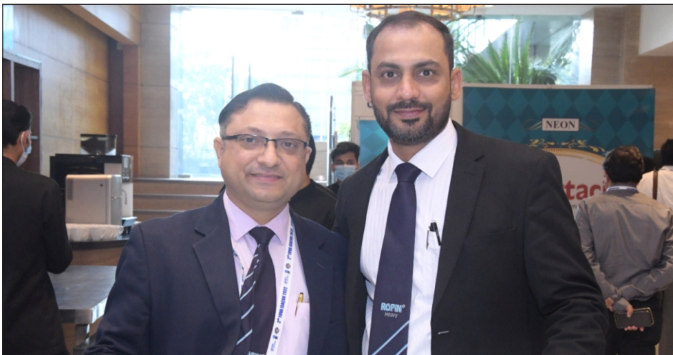
Trade & Industry Exhibition 2 nd National YUVA ISACON 2022, Haryana (14-15 October 2022)