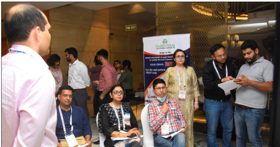
Paper & Poster Session 2 nd National YUVA ISACON 2022, Haryana (14-15 October 2022)