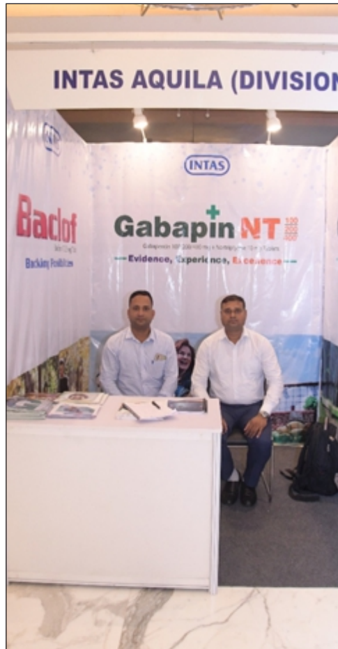
Trade & Industry Exhibition 2 nd National YUVA ISACON 2022, Haryana (14-15 October 2022)