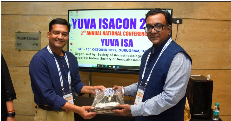
Paper & Poster Session 2 nd National YUVA ISACON 2022, Haryana (14-15 October 2022)