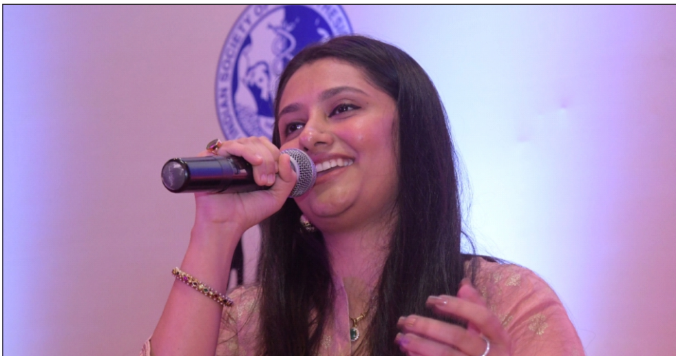
ISA YUVA KALA (Cultural Program) 2 nd National YUVA ISACON 2022, Haryana (14-15 October 2022)