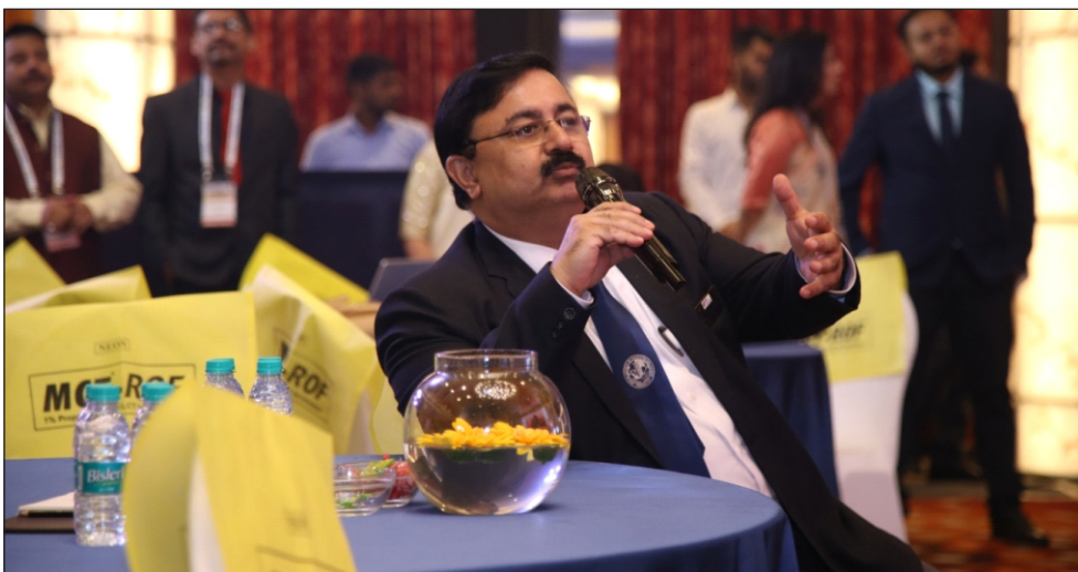
2 nd National YUVA ISACON 2022, Haryana (14-15 October 2022)