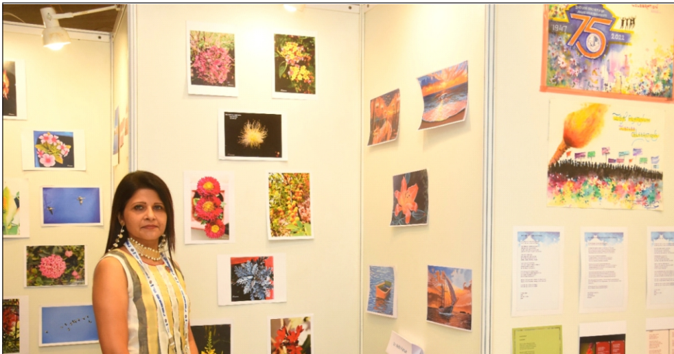
ISA ART & LITERARY CLUB SHOWCASE 2 nd National YUVA ISACON 2022, Haryana (14-15 October 2022)