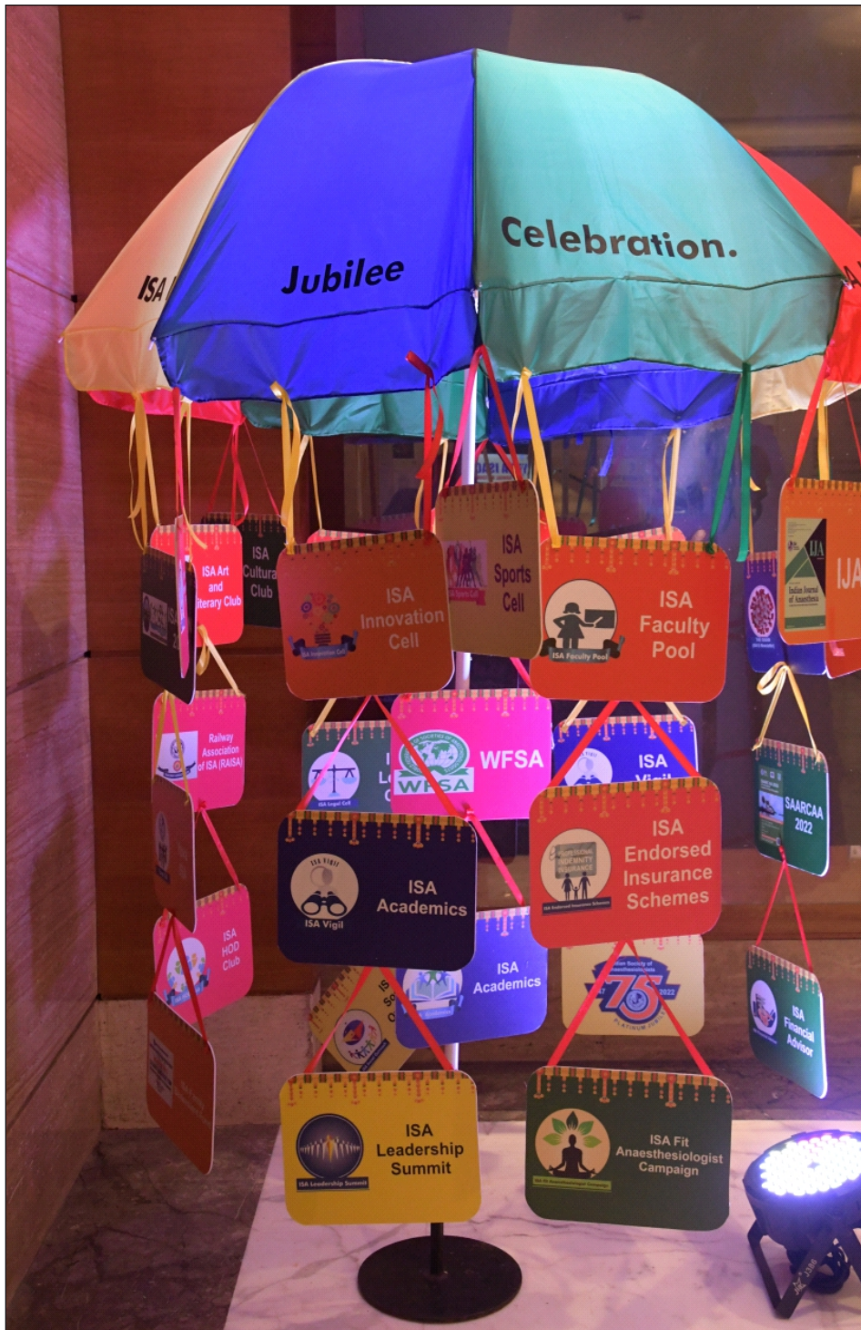
ISA UMBRELLA 2 nd National YUVA ISACON 2022, Haryana (14-15 October 2022)