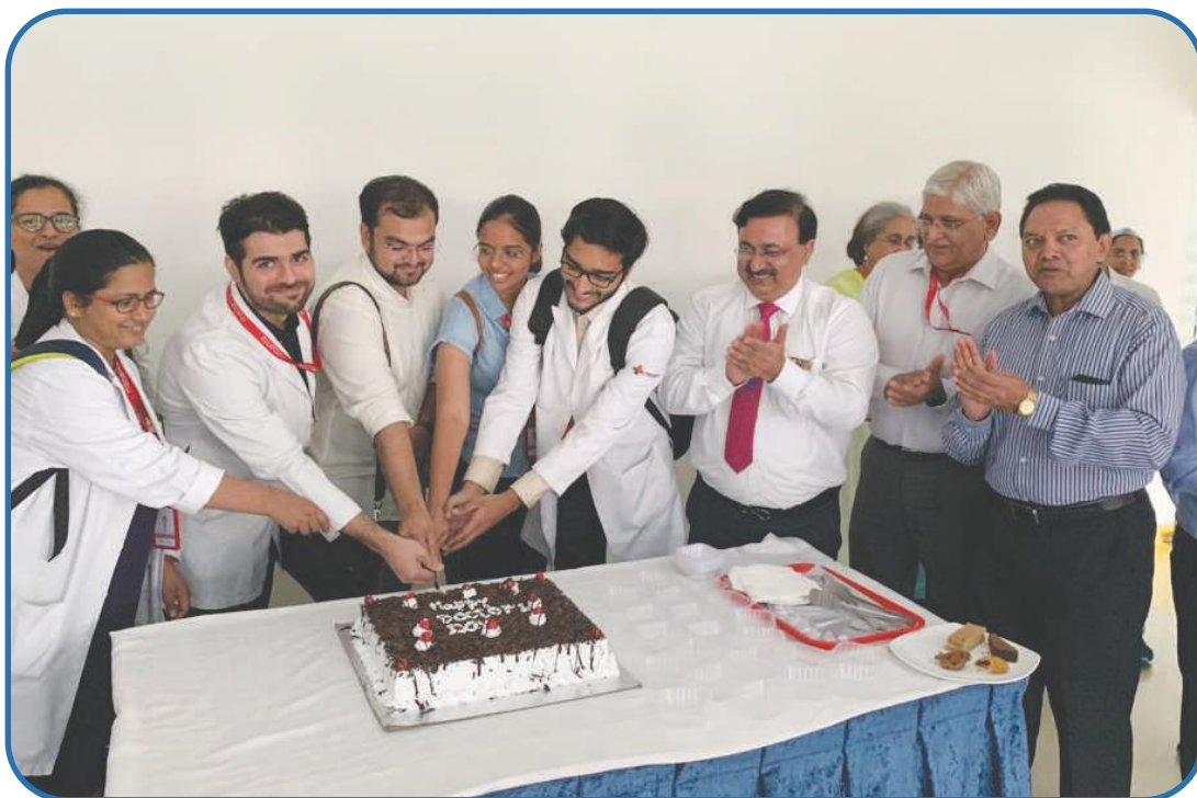
ISA Delhi Monthly Meeting (28 June, 2019)