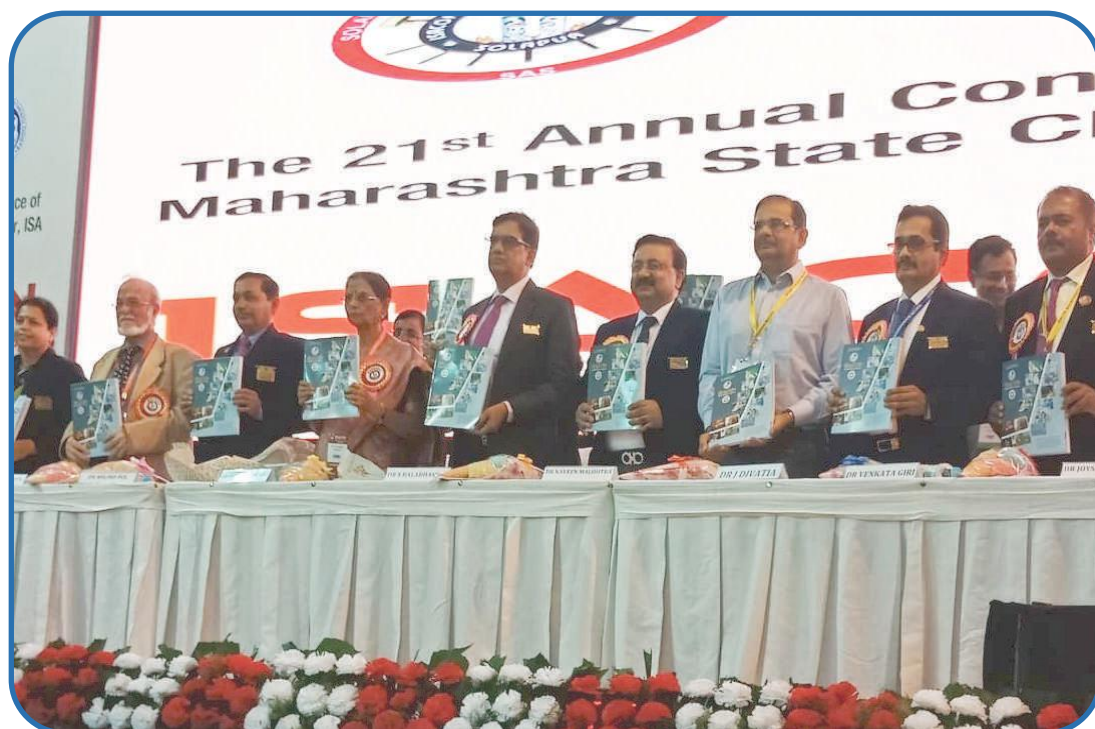
ISACON MAHARASHTRA, Solapur (20-22 September 2019)