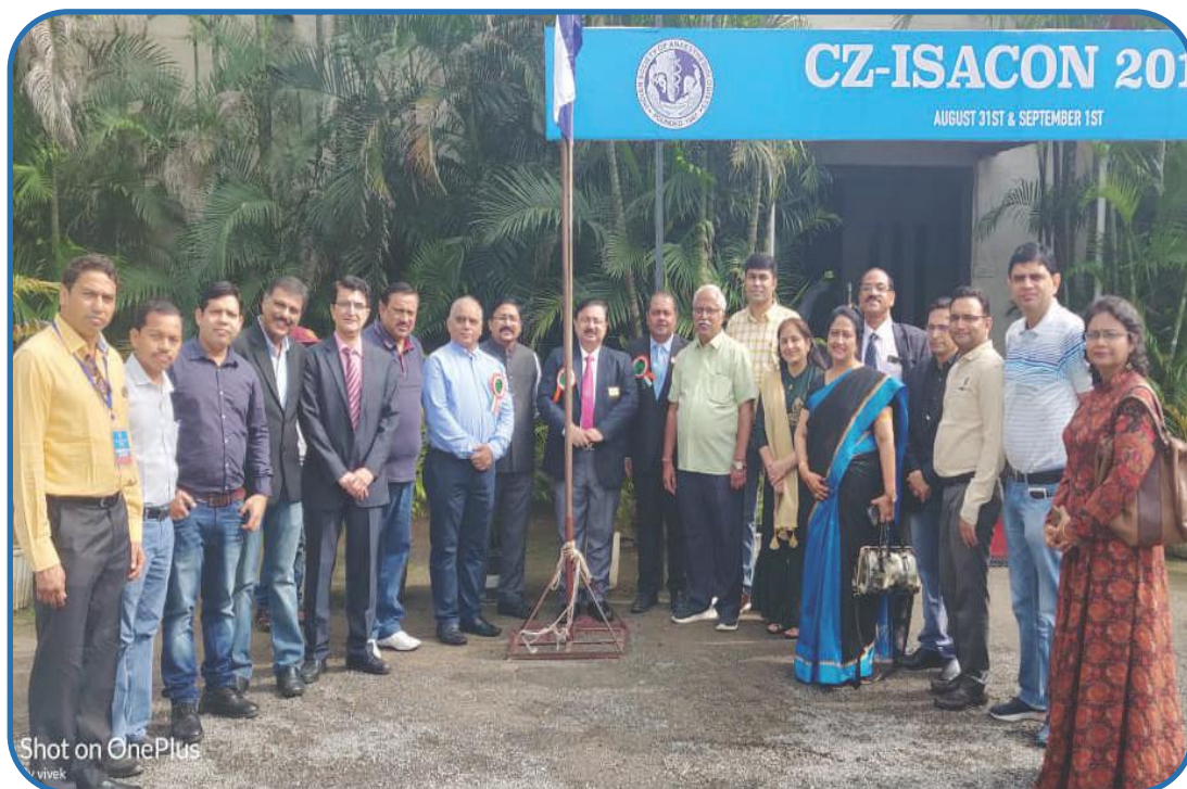
Central Zone ISACON, Raipur (31 August - 1 September, 2019)