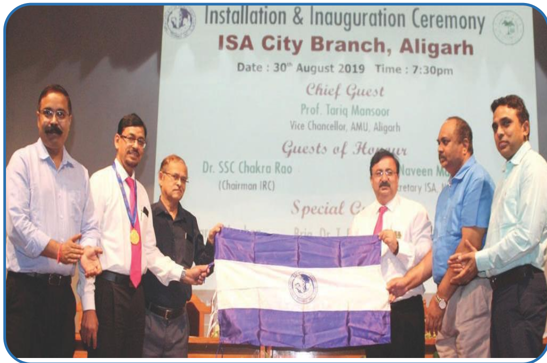
ISA Aligarh City Branch Inauguration (30 August, 2019)