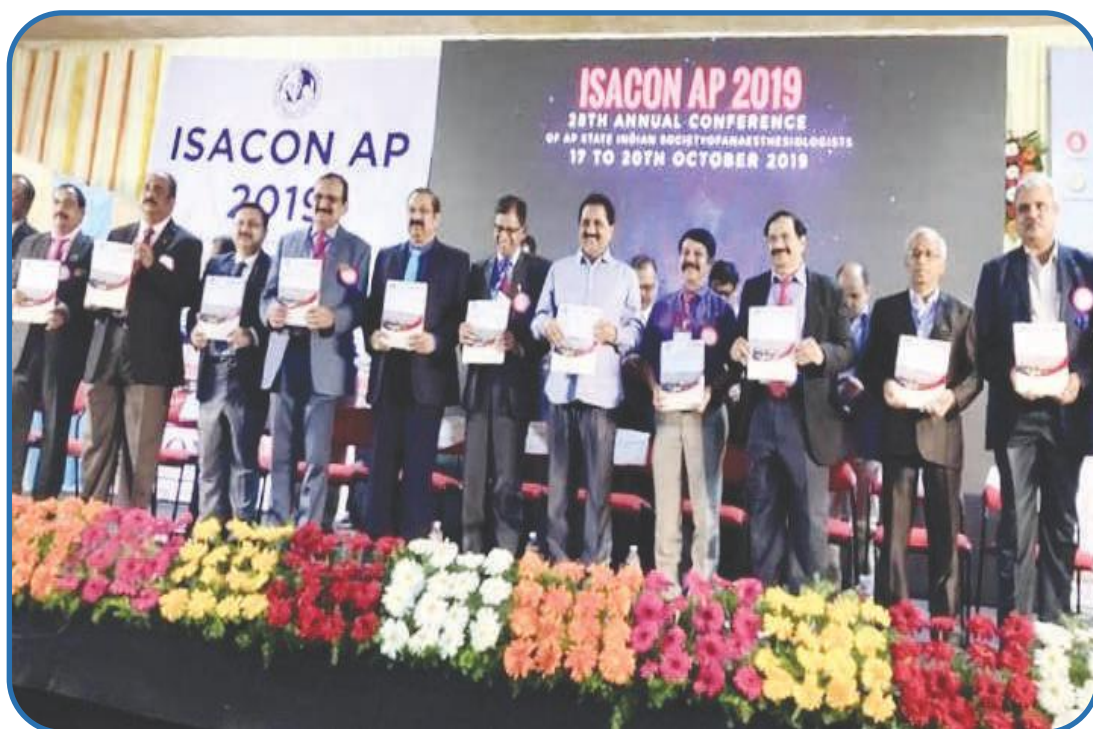
ISACON ANDHRA PRADESH, Amlapuram (18-20 October, 2019)