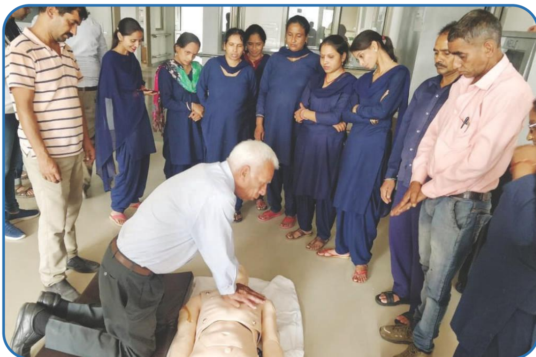
COLS on World Restart a Heart Day (16 October, 2019)