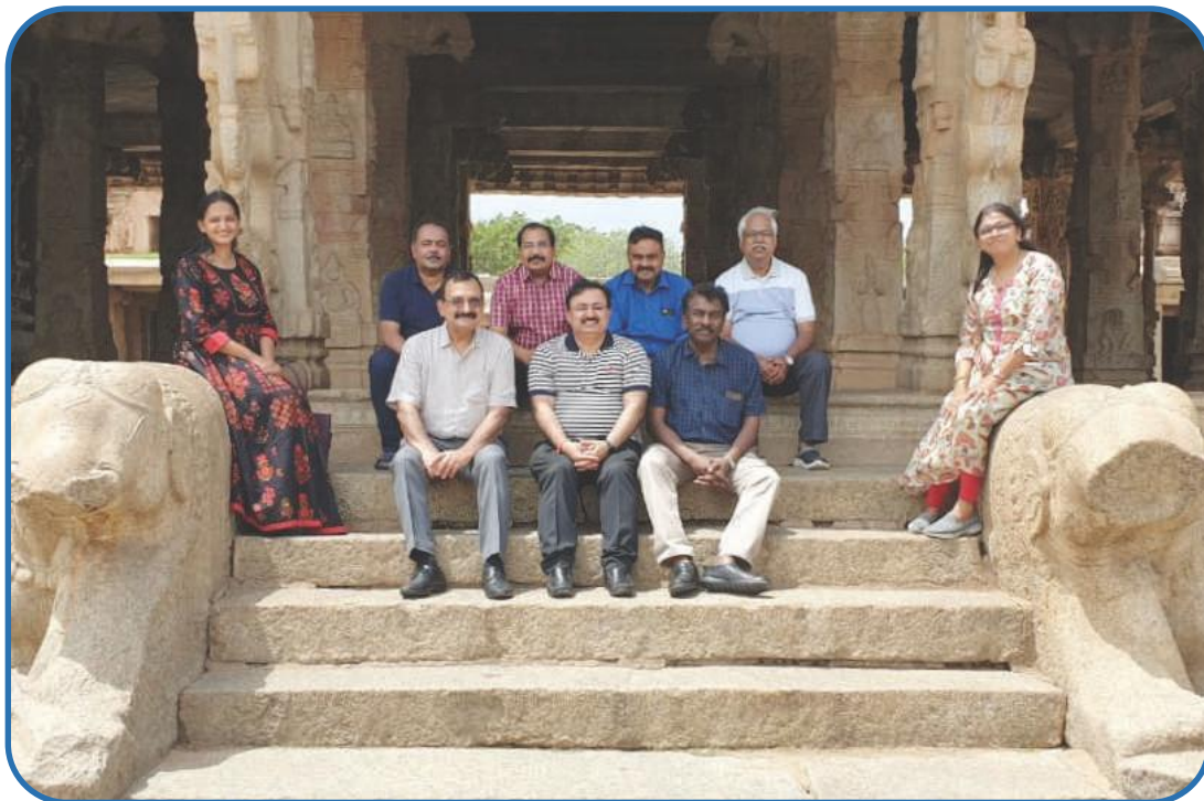
TEAM ISA 2019