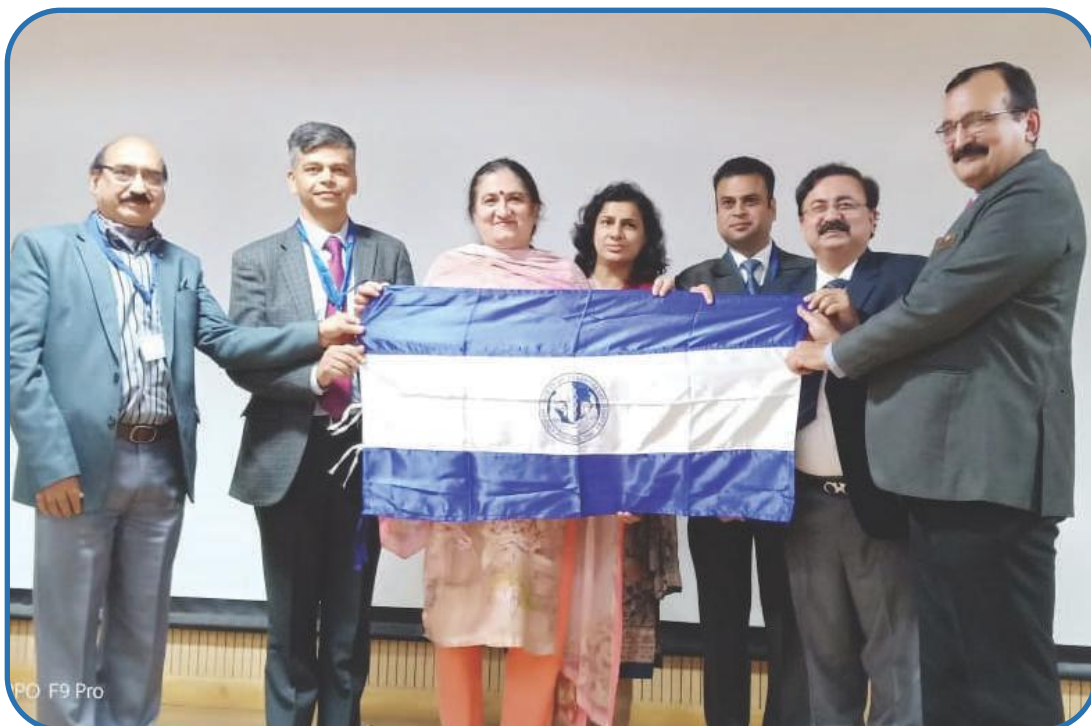
Inauguration of ISA Shimla City Branch (6 October, 2019)