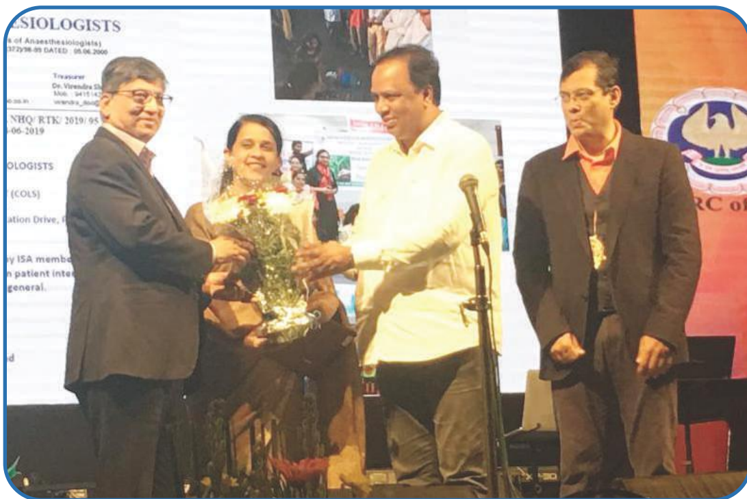
Felicitations of ISA by AMC, Mumbai (30 June, 2019)