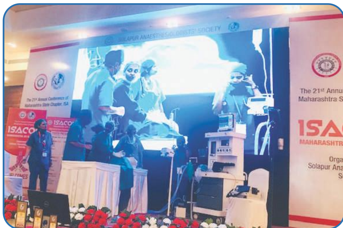
ISA CLINICAL CULTURAL CLUB, ISACON MAHARASHTRA, Solapur (September 2019)