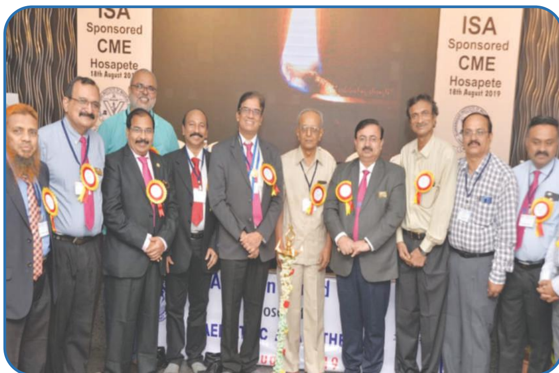
ISA Sponsored CME, Hosapete (18 August, 2019)