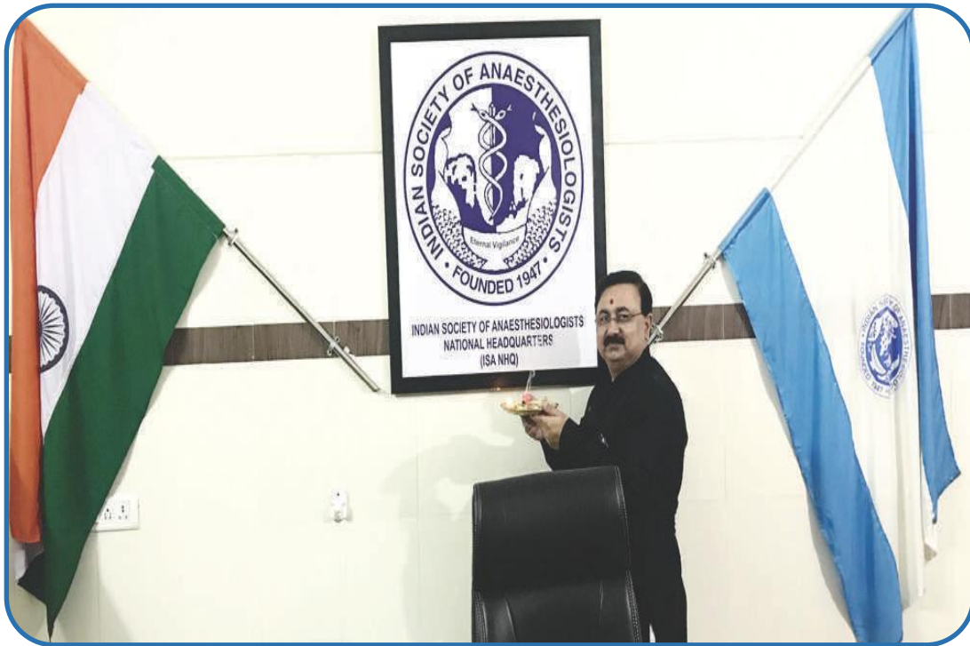
Diwali Pujan at ISA National Head Quarters (27 October, 2019)