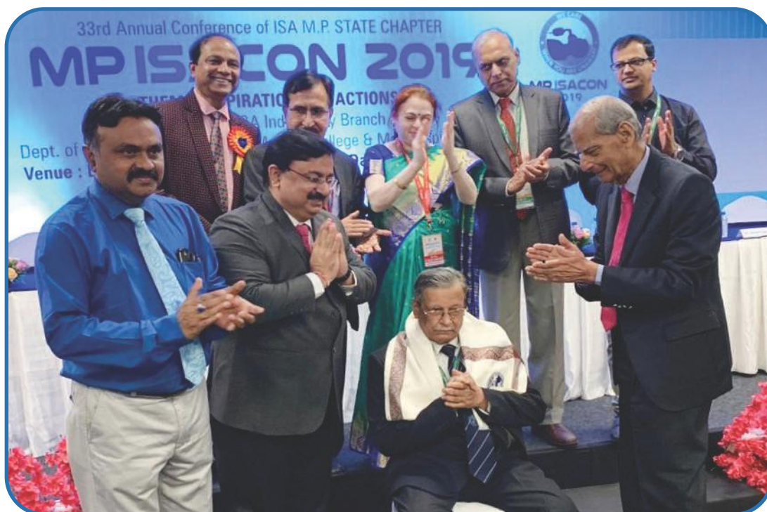
ISACON MADHYA PRADESH, INDORE (14-15 September, 2019)