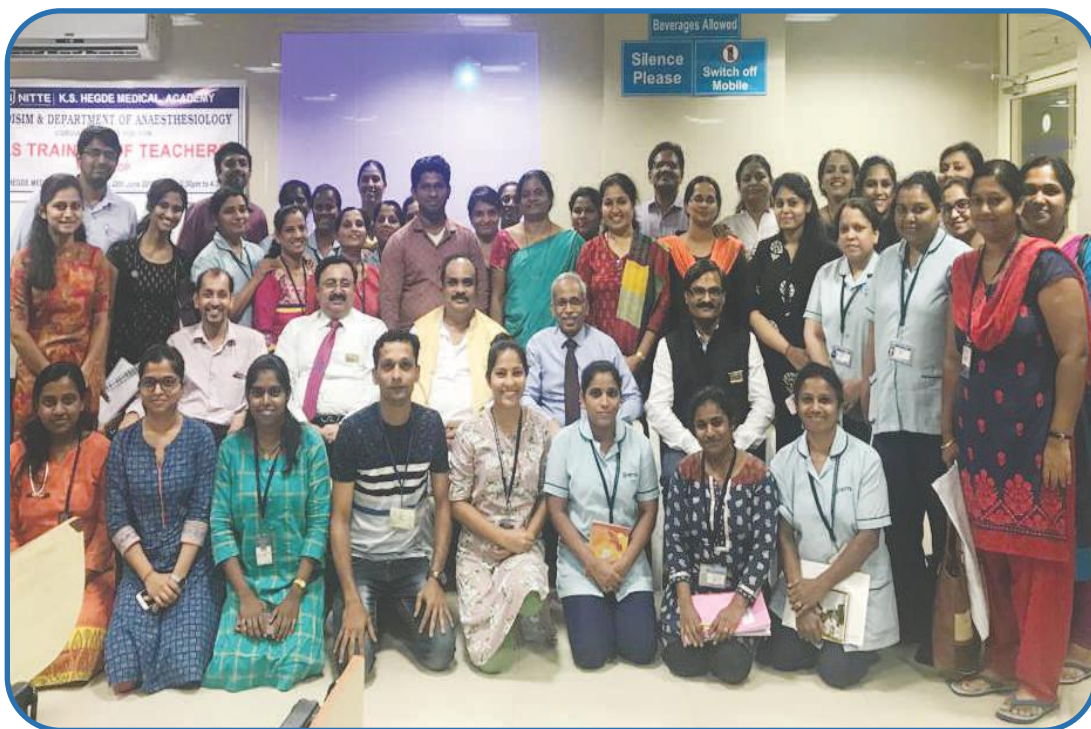
ISA IRC TOT Course, Mangalore (29 June, 2019)