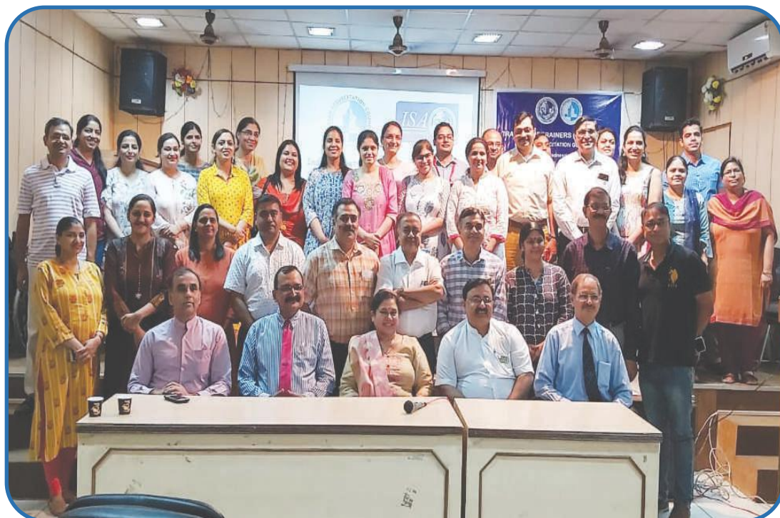
ISA IRC TOT Program, Rohtak (31 July, 2019)