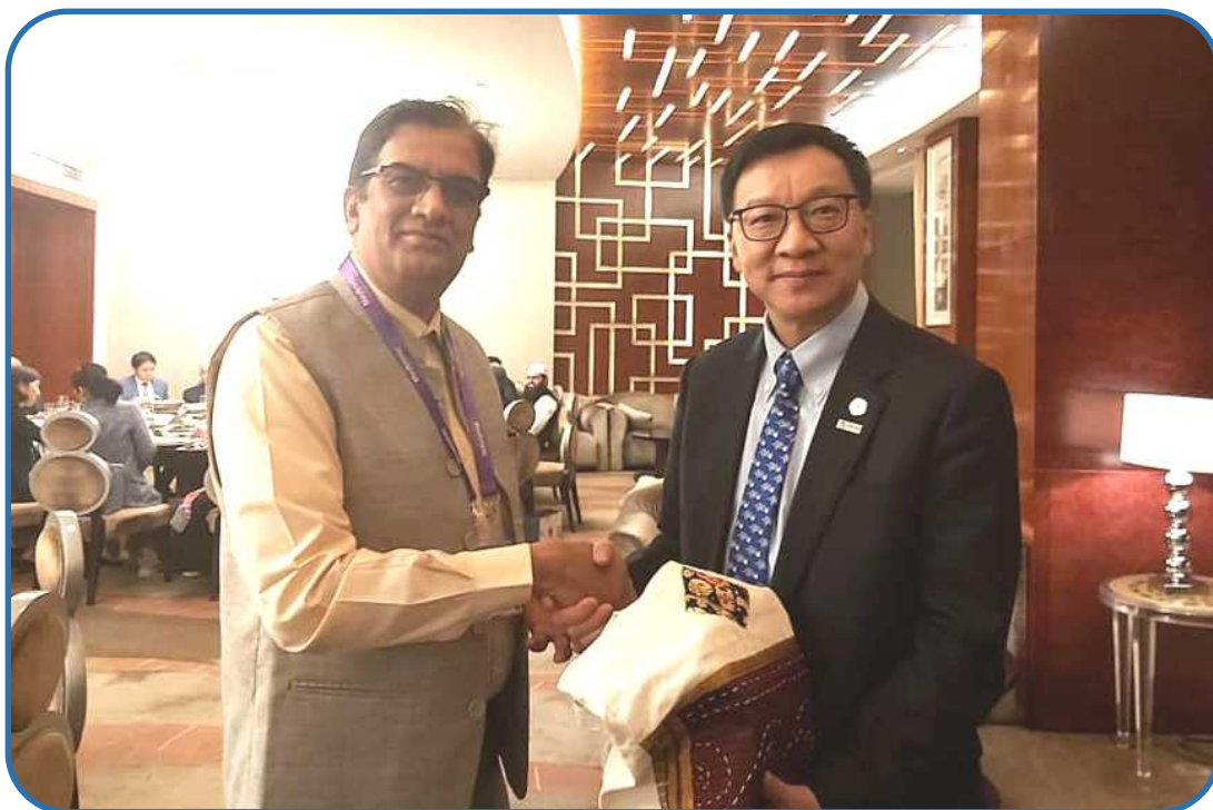
Chinese Society of Anaesthesiologists Conference, Hangzhou with President CSA (3 November, 2019)