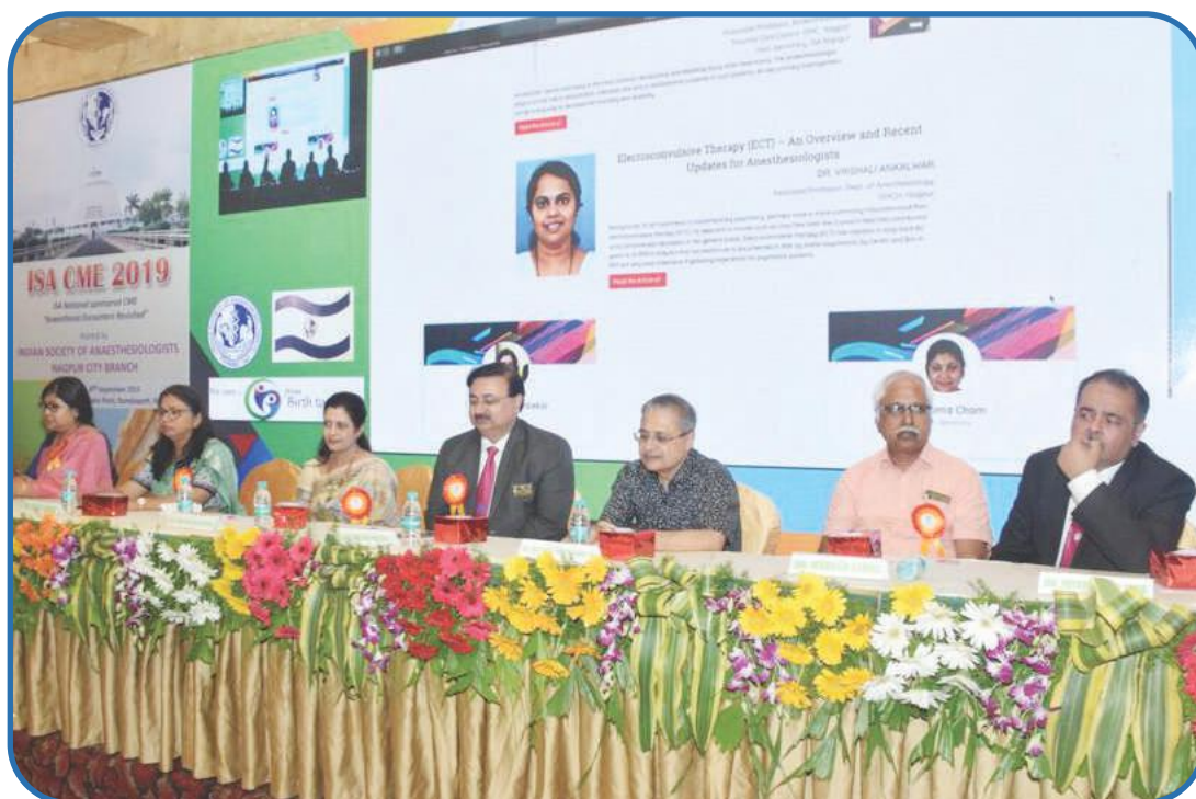
ISA SPONSORED CME, Nagpur (8 September, 2019)