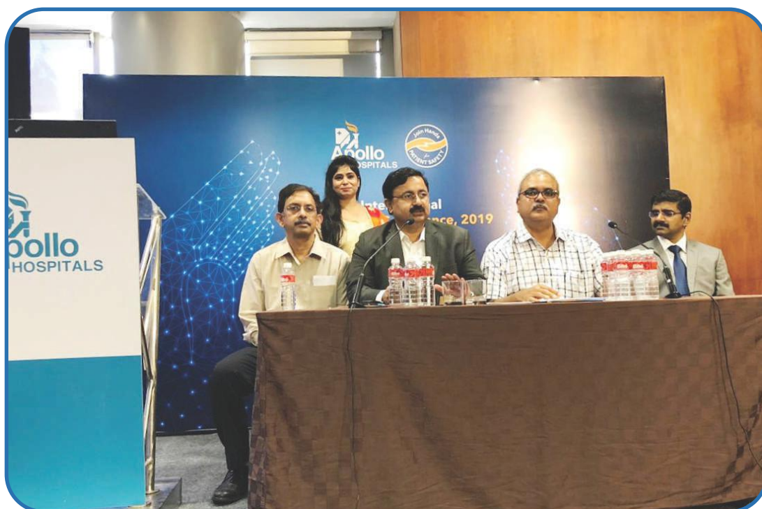
International Patient Safety Conference, Hyderabad (13 September, 2019)