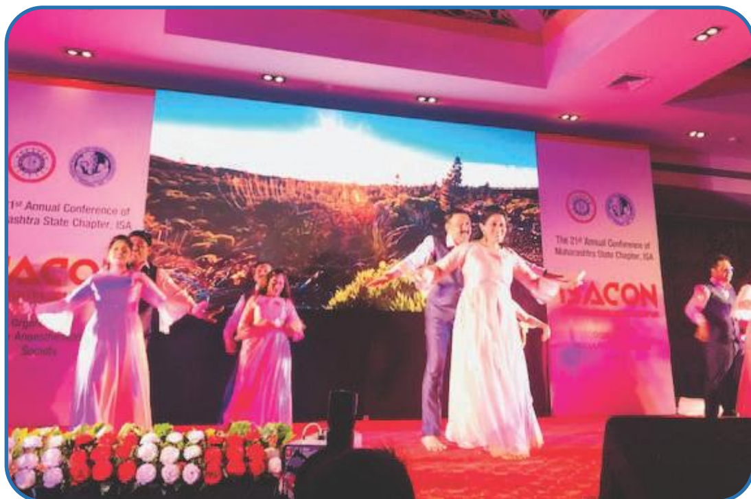
ISA CULTURAL CLUB Performances by Anaesthesiologists