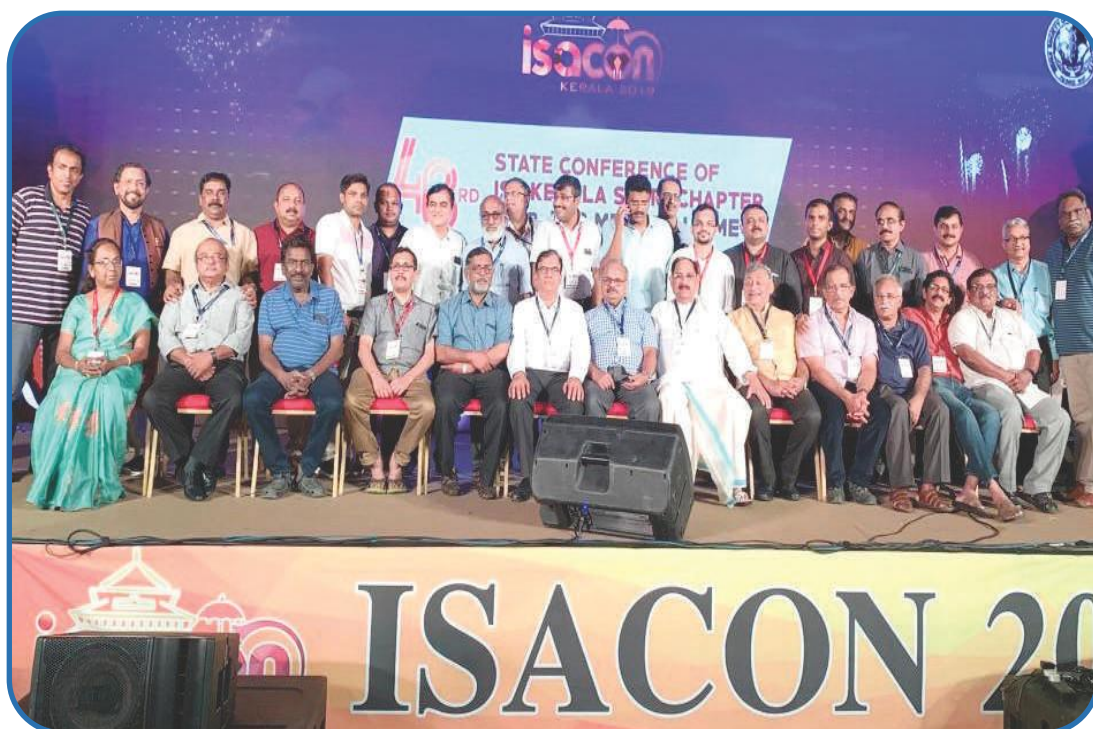
ISACON KERALA, Thrissur (18-20 October, 2019)