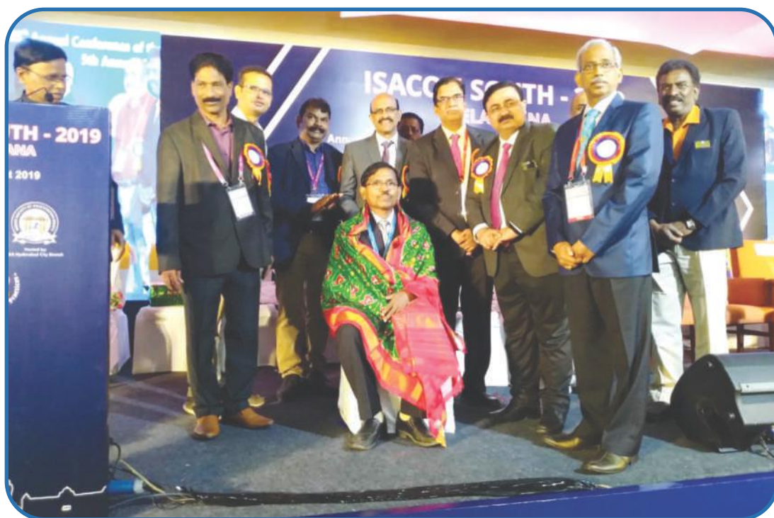
ISACON SOUTH ZONE AND ISACON TELANGANA, Hyderabad (9-11 August, 2019)