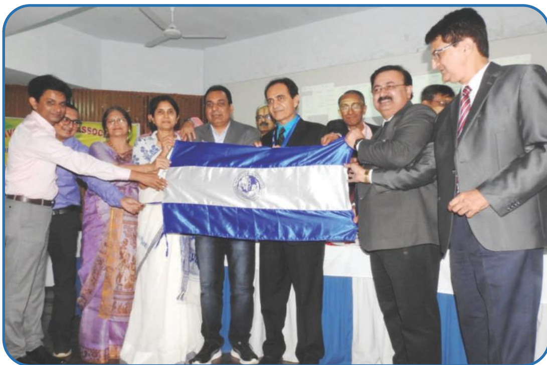
ISA Navsari City Branch Inauguration (17 November, 2019)