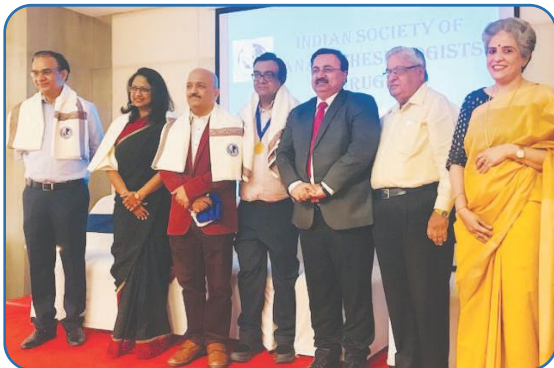
ISA Gurgaon City Branch Meeting and Installation of New Office Bearers (16 October, 2019)