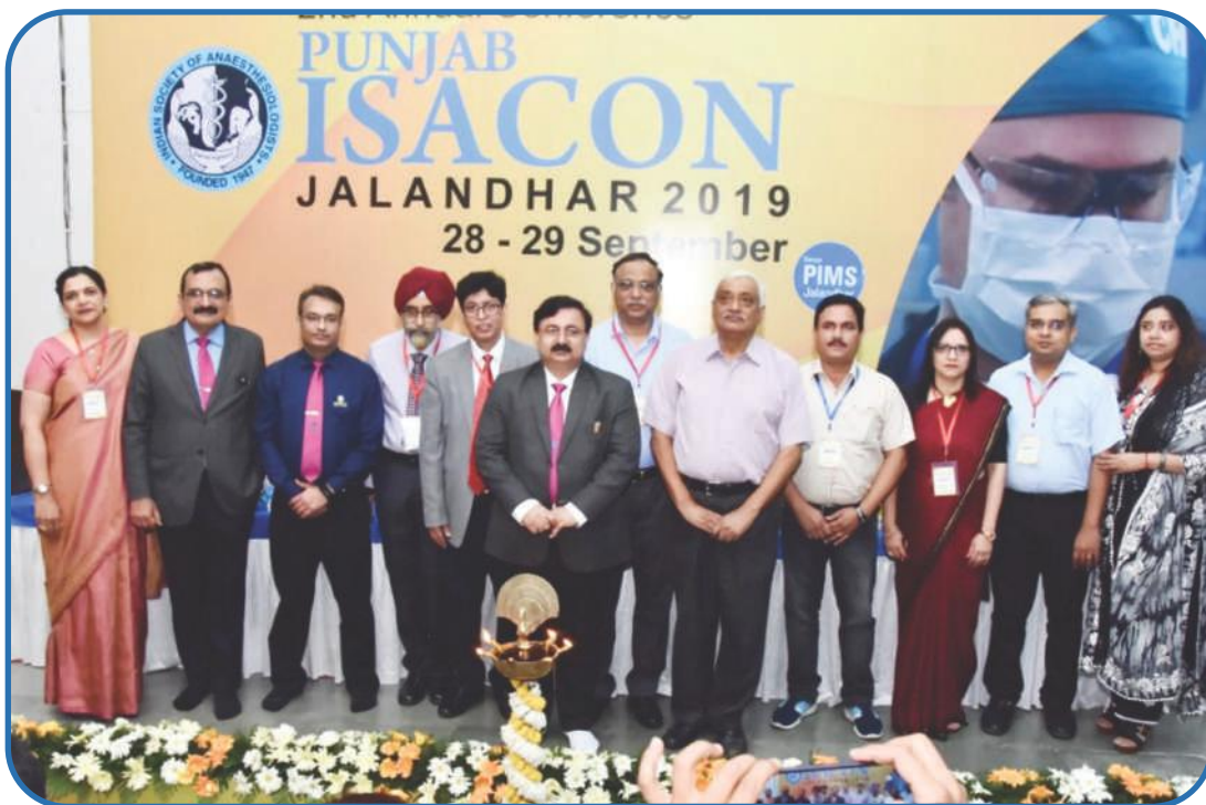
ISACON PUNJAB, JALANDHAR (28-29 September, 2019)