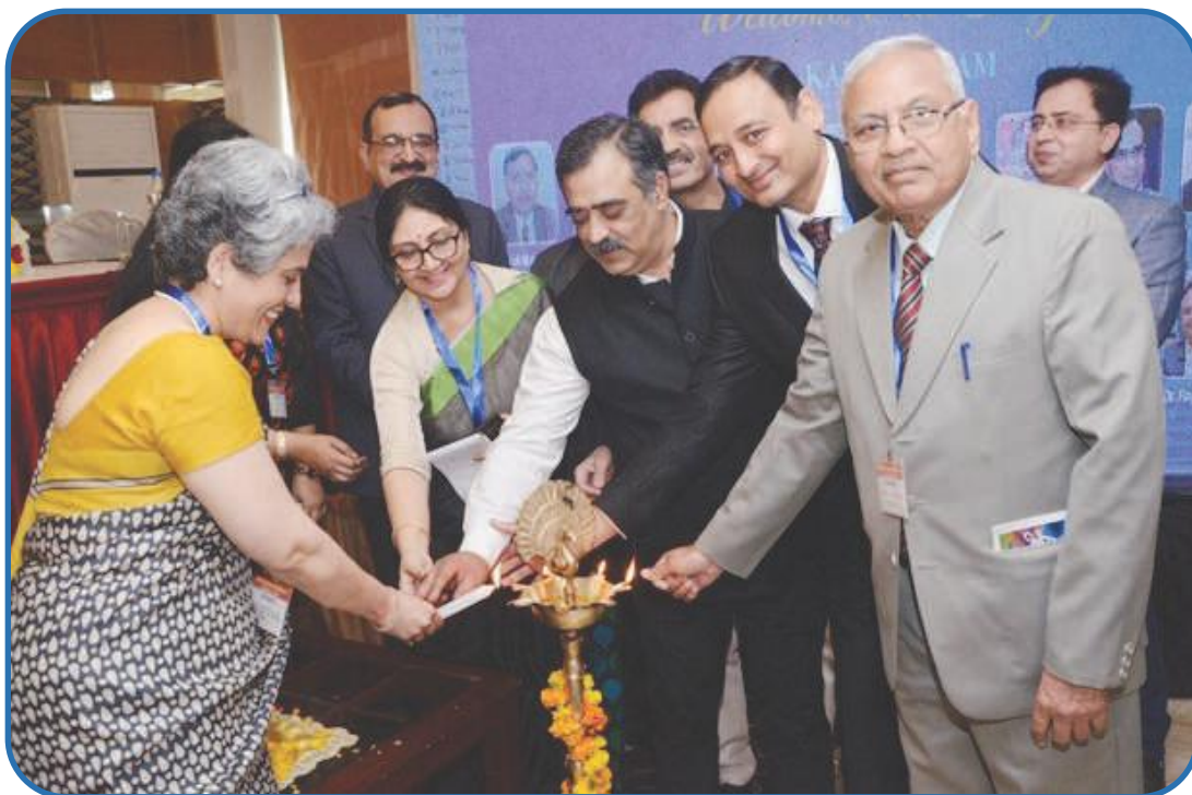
ISACON HARYANA, Karnal (10 November, 2019)