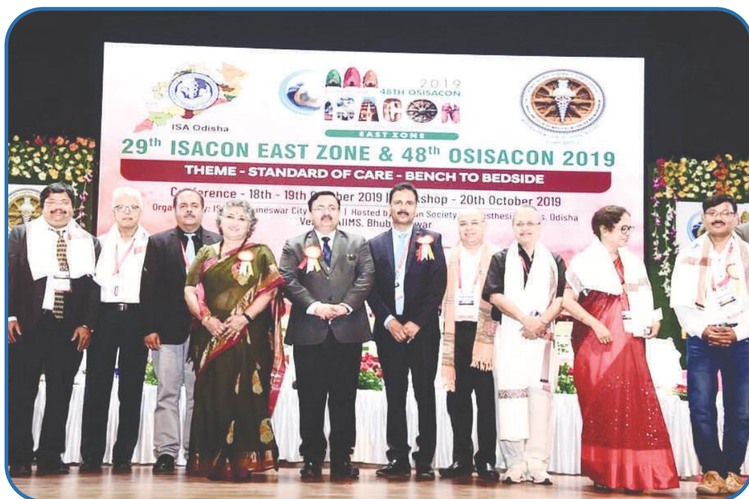
ISACON EAST ZONE AND ISACON ODISHA, Bhubaneswar (18-20 October, 2019)