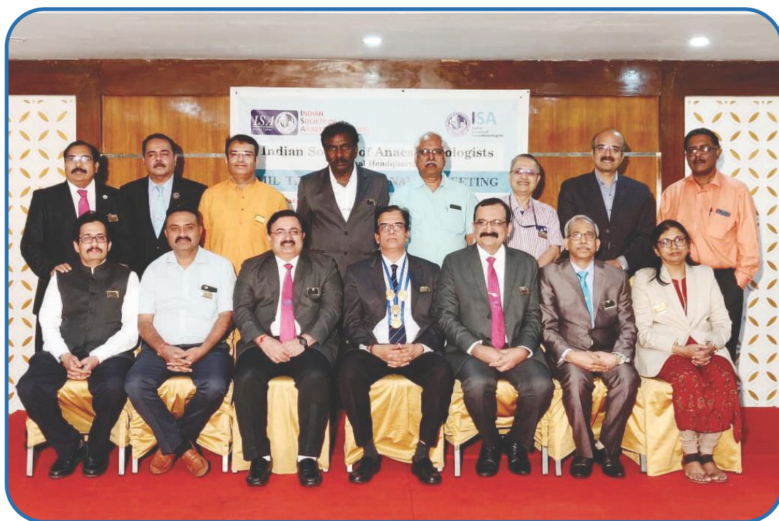
The ISA GOVERNING COUNCIL MEETING, Bengaluru (16 August, 2019)