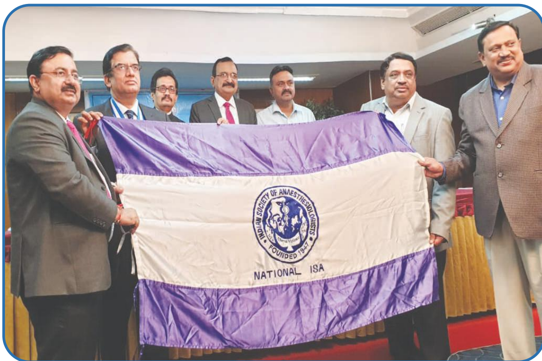
Handing ISA NATIONAL FLAG to 67th ISACON 2019, Bengaluru Organising Committee