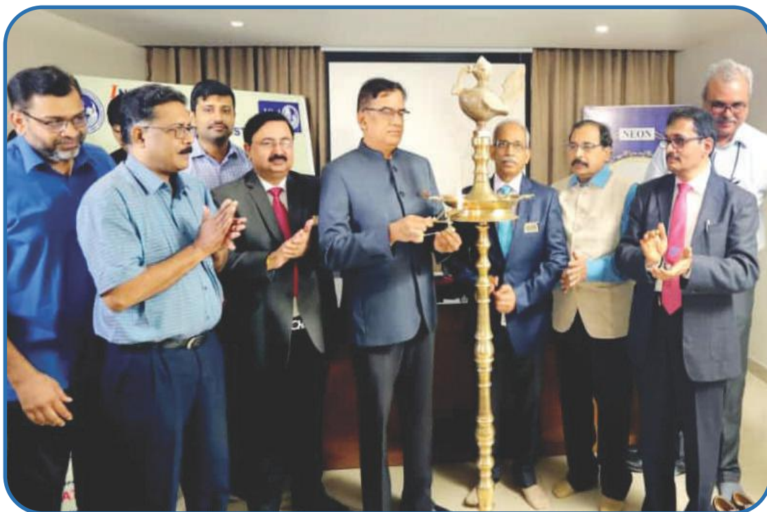
ISA Sponsored CME, Kasaragod (30 June, 2019)