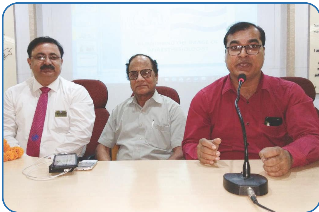
ISA Bareilly City Branch Meeting (31 May 2019)