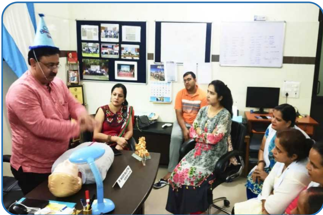
COLS PROGRAM at ISA NATIONAL HEAD QUARTERS