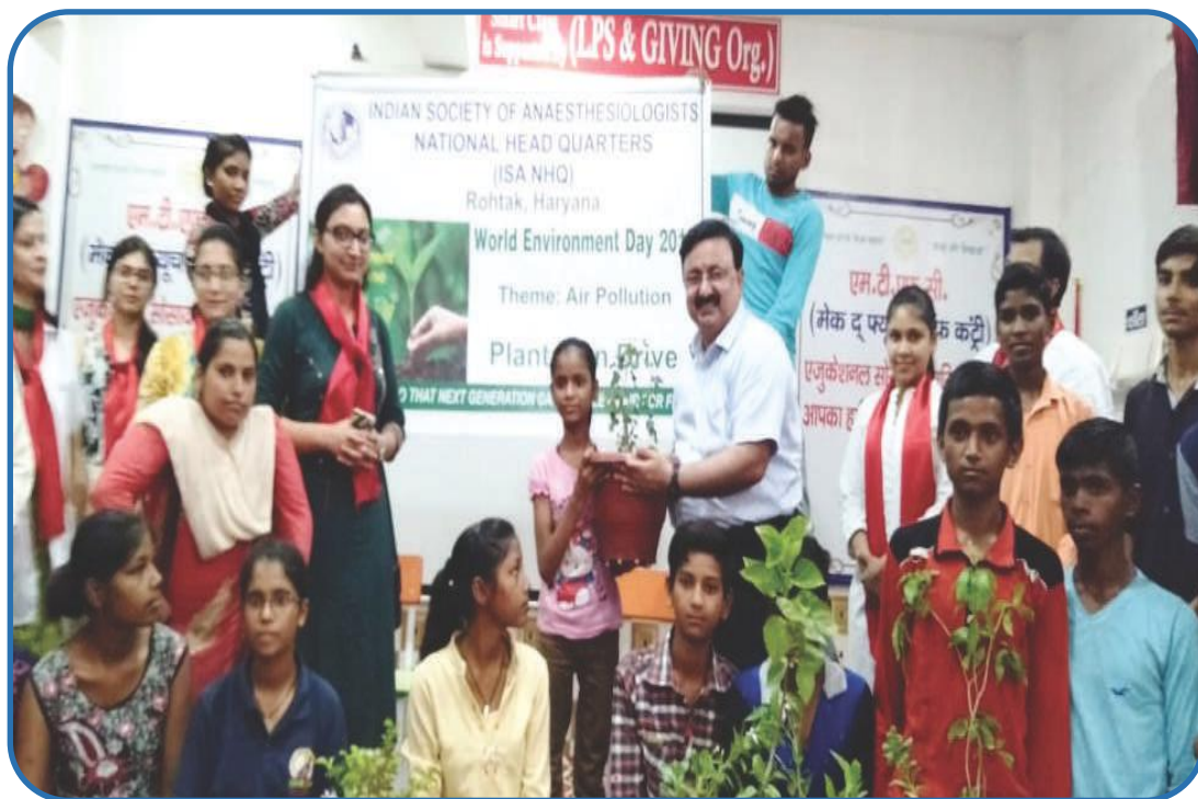
World Environment Week ISA NHQ, Rohtak (5-12 June, 2019)