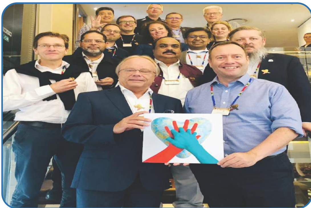
ILCOR & IRC MEETING, South Africa (2-3 November, 2019)