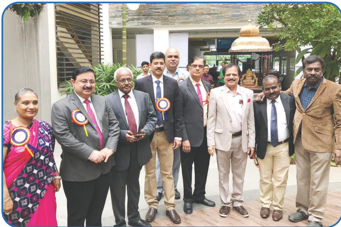
ISACON TAMIL NADU, Chennai (26-28 July, 2019)