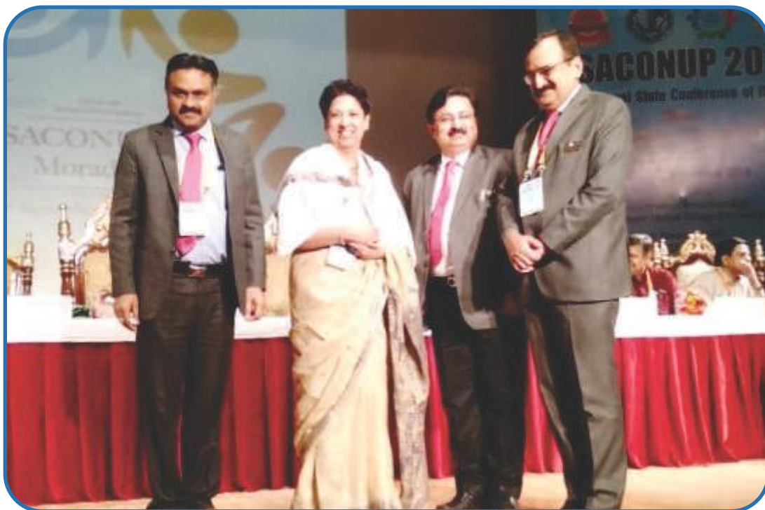
ISACON UTTAR PRADESH, MORADABAD (28-29 September, 2019)